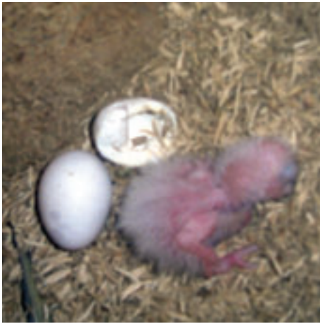
A two-day old Blue-throat chick. The second egg never hatched. This nest was predated in 2004 (by an unknown predator when the chick was around 8 weeks old), so it was rewarding to have it fledge successfully for the 2005 season.

when it came to incubating nests. Another factor to consider with respect to drain holes in motacú snags is the physical structure of the snags themselves. Lacking strong fronds above, one can not safely secure a rope over the crown for climbing purposes. Given the flimsy nature of most snags, the nest tree may actually fall over when climbing it. We devised a system of securing a bamboo ladder with ropes so that the weight of the ladder was never in direct contact with the nest. Unfortunately, some nest snags were over 10 m (30 ft) high, taller than the longest bamboo shafts we could obtain in the area. Aluminum-fiberglass ladders are on the shopping list for the next breeding season.