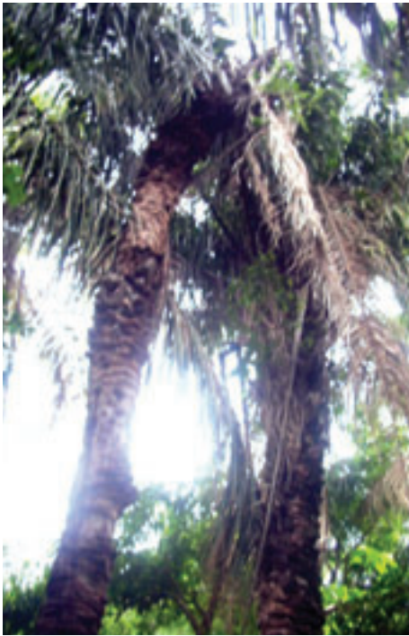
This active Blue-throats' nest actually collapsed after heavy rains. We found pieces of eggshell below it, a day after it had been abandoned. Presumably a chick had just hatched around the time of the storm.

me of an occasion when he'd been caught in one of these severe thunderstorms while riding on horseback to camp. The force of the wind and water coming at him was so powerful, his horse had to walk sideways to move forward, during which time lightning continually struck within 50 m of his position. In my colleague's words: "I thought I was a goner".