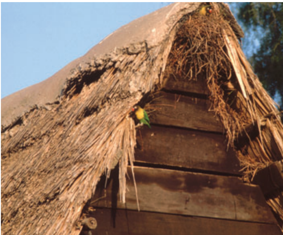
Pure Masked Lovebird near its shelter at a tourist hut.