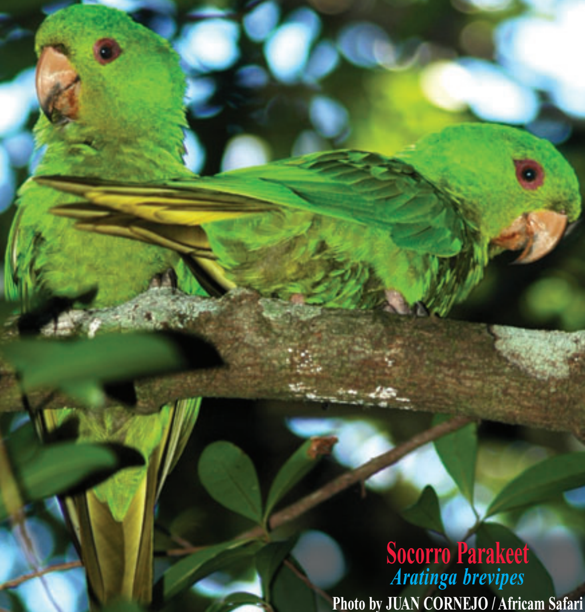
Socorro Parakeet Aratinga brevipes