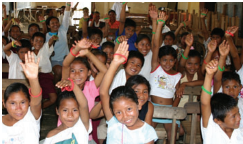
School children at the Nappi Primary School in Guyana proudly show off their new TradeBands donated by Foster Parrots. The class has an ongoing partnership with Elisabeth Morrow School in Englewood, New Jersey, USA.