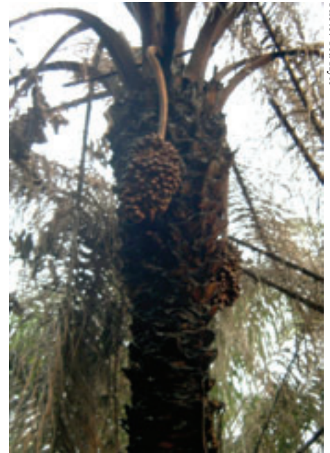
Despite the drought some motacú palms still produced large clusters of fruit, only to have them destroyed by fire. This palm had two racemes of fruit burned just as they ripened. The pulp of motacú fruits is the preferred food of Blue-throated Macaws.

Though 2005 had its share of disappointments, many positive things happened that are worth mentioning. Given that all the Blue-throats we currently know about are found exclusively on private lands, namely cattle ranches, cooperation with landowners is key to Blue-throat recovery. With this in mind, this past season was a resounding success. The level of commitment from ranchers at key sites went above and beyond simply granting permission to work on their land. On two ranches, land owners actually provided us with our own rooms in their houses to work out of, as well as loaning us horses to get around on. The latter gift was no small item, since due to the heavy rains, our study area flooded much earlier than in previous seasons. Without the use of the truck and motorcycles, horses became