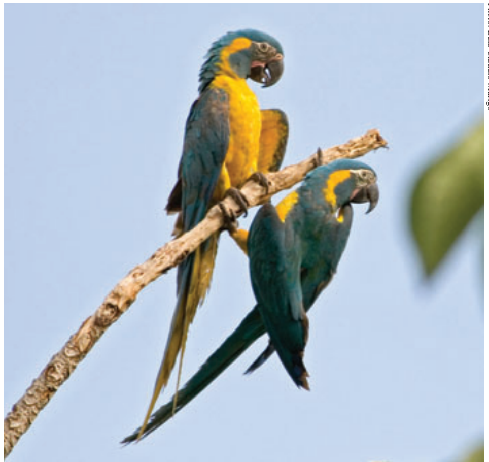
This pair of first-year chicks frequented the trees behind one of our field camps. Both birds were molting their wing feathers. We saw more first year chicks during 2005 than any other field season, suggesting that the 2004 breeding season was a good year for Blue-throats. Superficially we know that rainfall was higher in 2004 compared to other seasons, possibly translating into more food resources and hence more chicks fledging.

unlikely when they have chicks. During incubation however, the threat is likely higher as the nesting pair have invested relatively less time and energy in the nest compared to a nest containing a chick. If they feel their own safety is in jeopardy due to the presence of humans, they are more likely to leave a nest with eggs behind. Thus we decided to be more 'hands off'