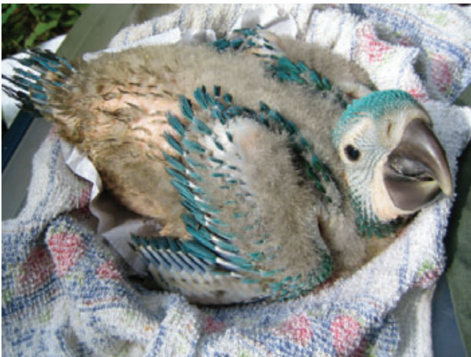
'Soledad' at four weeks of age. Soledad is an appropriate name for her, as it means, 'alone or solitary'. Soledad was the only chick our team worked with during what was a difficult field season weather wise. She fledged successfully January 31st 2006. A special thanks to volunteers Pedro Costa and Ulla Kail for monitoring Soledad's progress until fledging.

By having more people in the field this season, the level of information we collected increased dramatically. For example, we now know that the 2004 breeding season was a good year for Blue-throat chicks. In previous seasons we'd rarely observe more than 3 or 4 first-year chicks throughout the entire study area. However, this past year we saw a total of eight chicks north of Trinidad (including the two chicks we worked with in 2004) and are aware of at least two chicks entering the smaller population south of Trinidad. Although at first glance these numbers seem low, to see this many wild Blue-throat chicks represents a 'bumper crop' when one considers that we're aware of only about 100 birds at present. In 2004, the total rainfall for the year was almost 1,000 mm (36 inches) greater than for 2005. Whether this higher level of rain translates into more chicks entering the wild remains to be seen. We've also begun to learn that Blue-throated Macaw are not as sedentary as previously thought. In past seasons I could show up at a given forest island and reliably find a pair of macaws there. Not so in 2005, as it appeared that some birds were shifting territories in