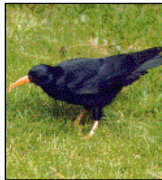
Chough, Cornwall's national bird.