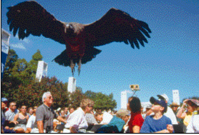
At the Texas State Fair the audience ducks as an Andean Condor sweeps over.

me so much in my lifetime; I feel it is my responsibility to give something back. I hope you feel the same.