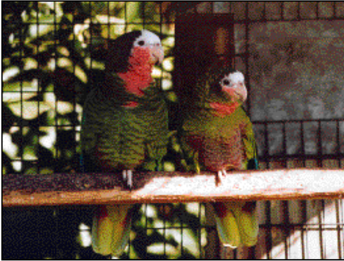
Male Cuban Amazon (left) with female Cayman Brac Amazon

captive propagation programme seems appropriate in view of the small population size and restricted range.' This was not initiated, despite the fact that captive birds on the island could have been used for this purpose. In 1986 Patricia Bradley estimated that there were more than 200 in captivity there. This was surely an over-estimate; many or even most of the captive birds are likely to have been Grand Cayman Parrots ( A.l.caymanensis ). The main differences between the two sub-species are the significantly smaller size of hesterna, smaller area of pink on the head and larger area of vinaceous on the underparts.