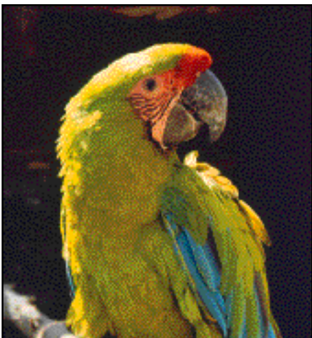
Buffon's or Great Green Macaw

I would also invite WPT members who may like to be involved to contact us at WPT-UK or WPT-USA. We could try to match our $10,000 for the year 2000 with a similar sum from our membership. What a triumph that would be!