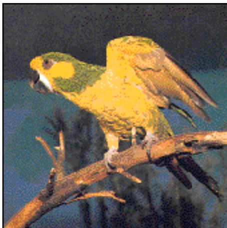
Yellow-eared Conure (Ognorhynchus Project)