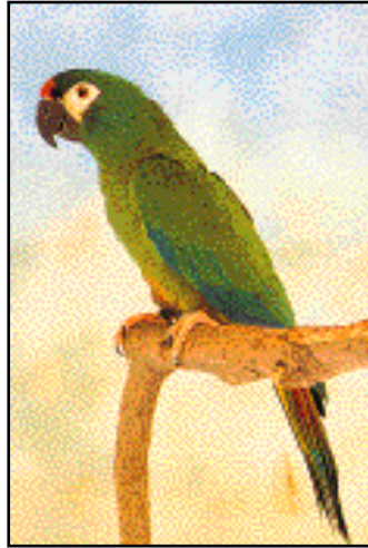
Blue-winged or Illiger's Macaw