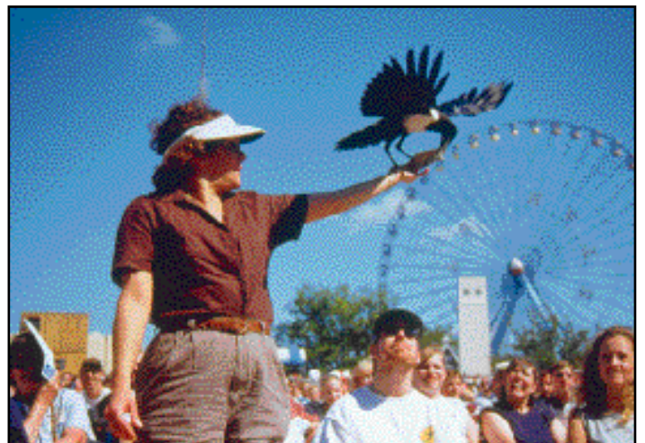
An African Pied Crow collects a dollar bill.