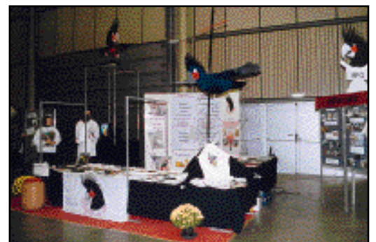
The new WPT Benelux exhibit.