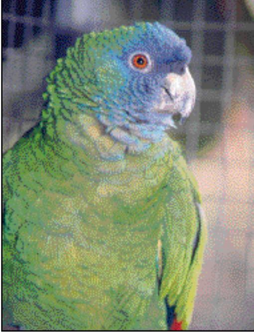
Red-necked Amazon from Dominica