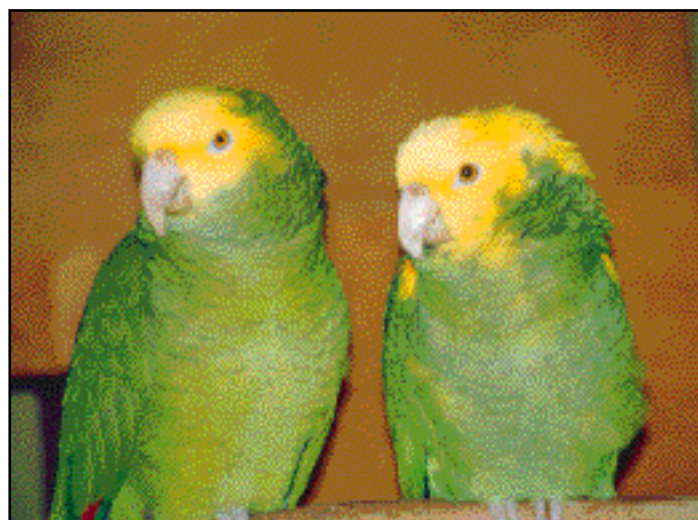
A.o.belizensis (less yellow on face) with an oratrix which is not fully mature.

Some members of the ochrocephala complex are well represented in aviculture and two or three are bred in substantial numbers. This is not true of belizensis which has never been common. In addition, it may be perceived as