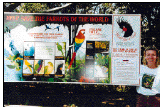
WPT Board at Currumbin, Queensland, Australia

As at June 30 1998 there were 53 North Island Kaka in captivity (including the three in Stuttgart Zoo in Germany). They consisted of 31 males, 19 females and five young birds. The good news is that during the 1997/1998 season some Kakas were permitted to breed, thus five were reared this year. [The former DOC policy was to smash eggs - Editor.] Twelve of the 13 Kaka released at Mount Bruce in 1996 and 1997 are still in the reserve. The captive population of South Island Kaka remains at eight birds. There are no viable