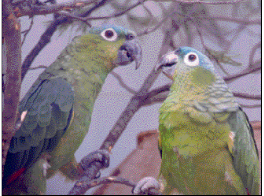
Blue-crowned (Mealy) Amazons

less desirable as it has less yellow on the face than the better known oratrix forms. I feel that belizensis should be the subject of a studbook in Europe in order that breeders can stay in contact. I suspect that breeders are few.