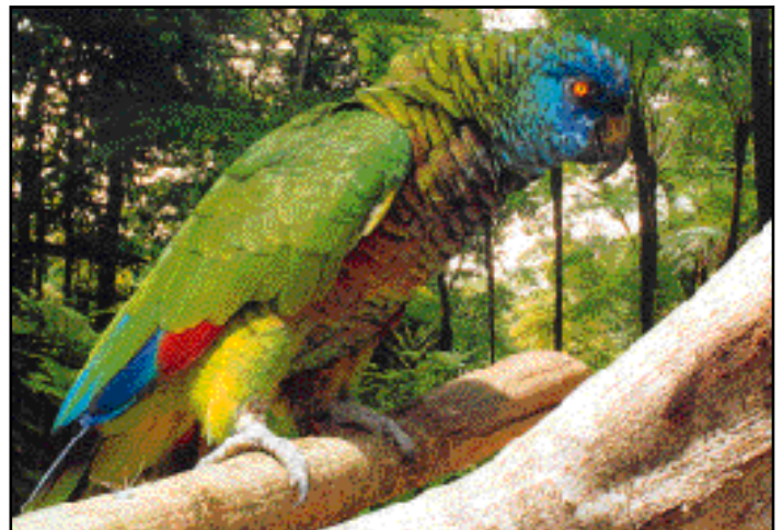
St. Lucia Parrot