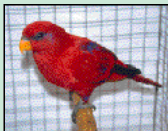
Bird B: Red or Moluccan Lory