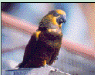
Bird A: Duivenbode's Lory