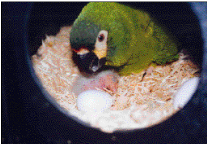
Illiger's Macaw and Chicks