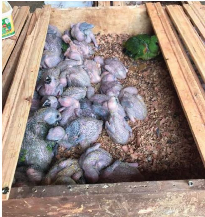
130 confiscated Blue-fronted Amazon chicks of different ages arrive to begin rehabilitation