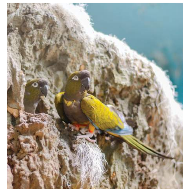
Patagonian Conures at cliff nest, Argentina

Four of the Agapornis species build dome-shaped nurseries in tree cavities, while the Peach-faced Lovebird ( A. roseicollis ) constructs a stick cup in a cavity. A. taranta and A. canus line theirs with twigs, leaves and other plant litter, and A. pullarius uses burrows in arboreal ant or termite mounds. In addition, all lovebirds except swindernianus carry construction material back to the nest under their wing and rump feathers (Eberhard, 1998).