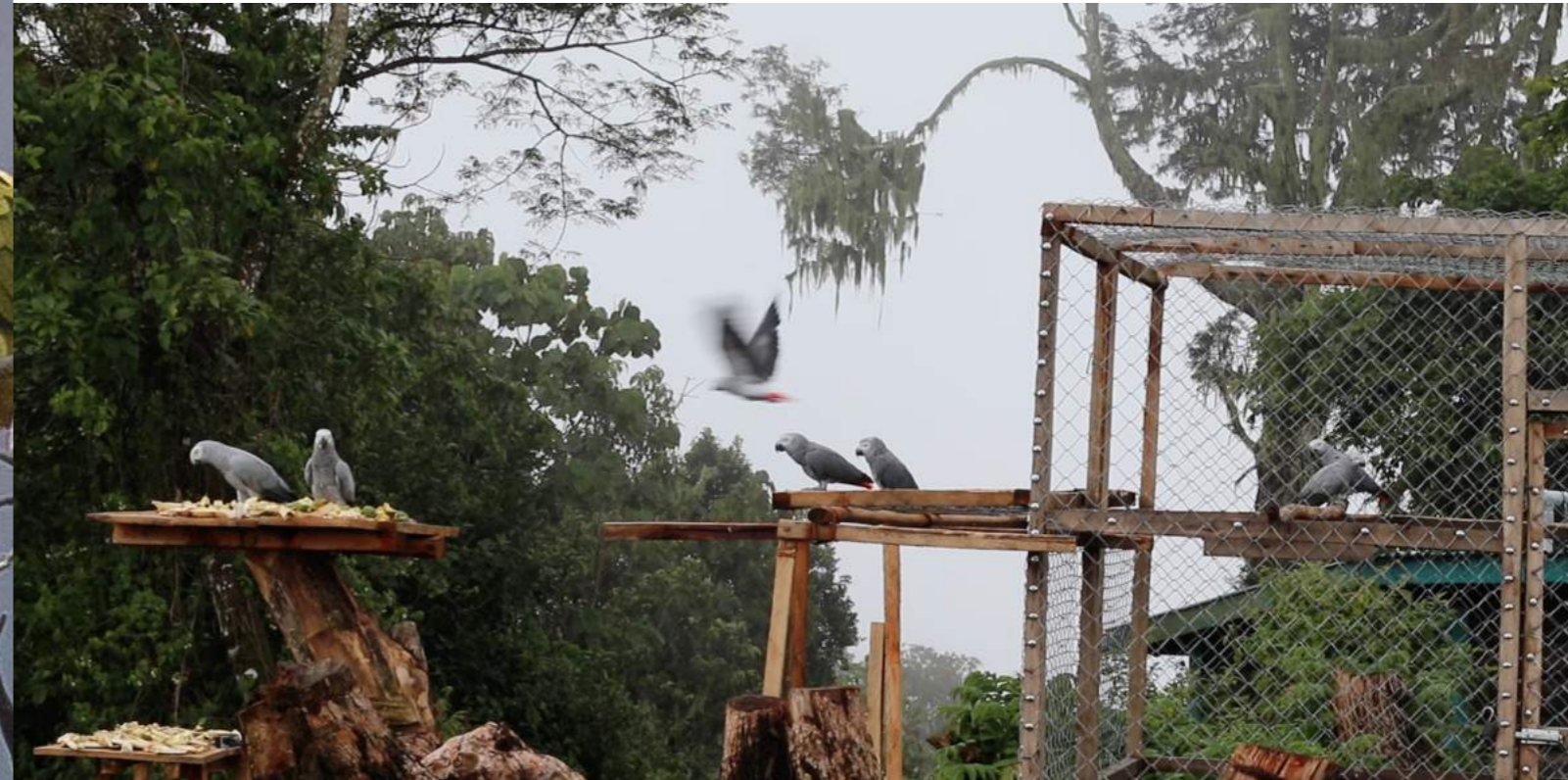
The first ever Grey Parrot release in the DRC.

“ The moment these birds were released was met with smiles and relief as the parrots cautiously ventured out into the wild... ”