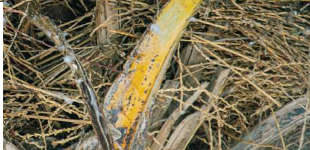
Monk Parakeets at a large nest with multiple cavities

Monk Parakeets have taken nest building to a new level of complexity, building large colony nests (Forshaw 1989). These apartment-style twig dwellings, used year-round as brooding and roosting centres, can measure several feet across and be used simultaneously by the parakeets and other species of birds. Feral Monk Parakeets found in several Mediterranean cities co-nest with White Storks ( Ciconia ciconia ), possibly for protection (Dailos Hernández-Brito et al, 2020). In South America, American Kestrels ( Falco sparverius ) and Speckled Teals ( Anas flavirostris ) have been recorded nesting with the parakeets in chambers not being used by the birds (Eberhard, 1998).