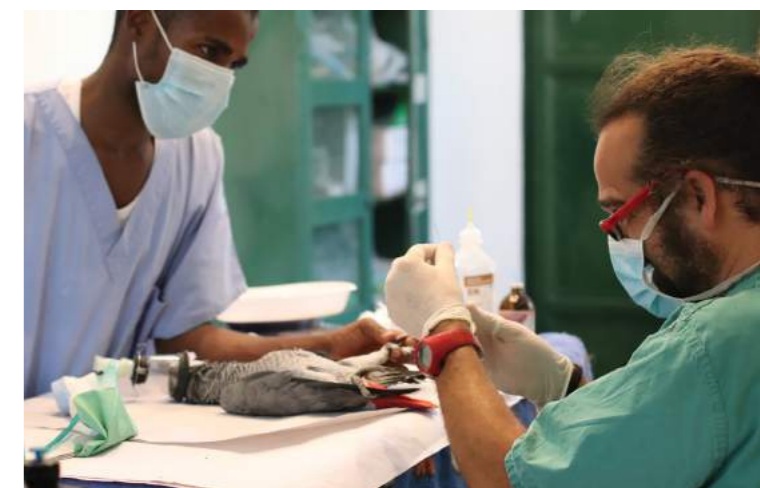
Top: The 2019 seizure in Kindu Bottom: Conducting initial health exams after confiscation