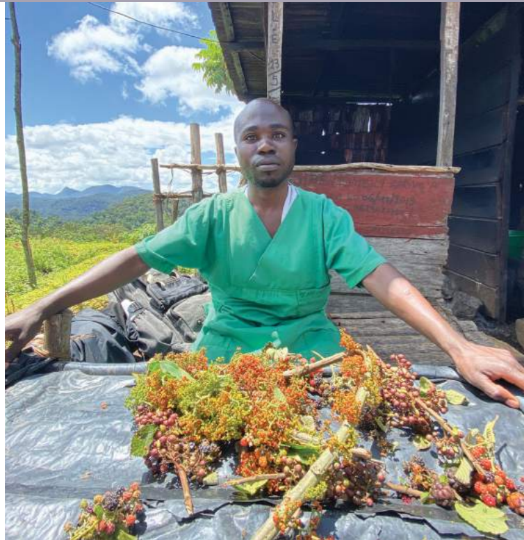
Preparing foods from the forest for the birds