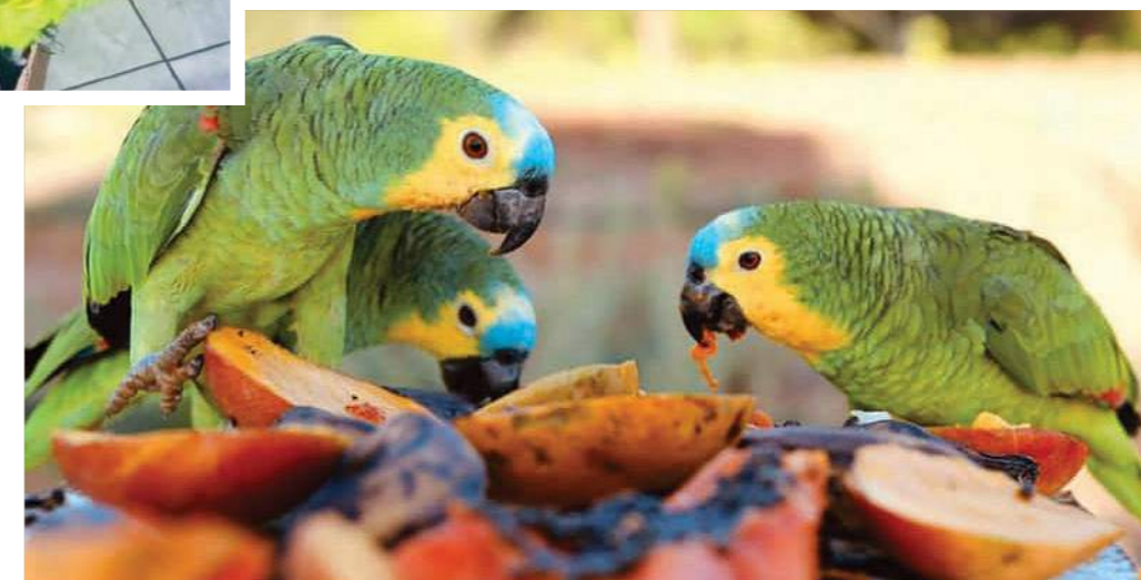
Far left: Wild Blue-fronted Amazon Top: Confiscated Blue-fronted Amazons of different ages Upper right: Released birds at feeding platform Lower left: Adult birds feast on fruits