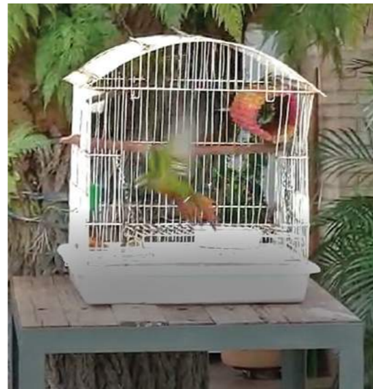
Top: A Maroon-bellied Conure arrives after a collision Middle: Undergoing intensive care treatment for concussion Bottom: Successful release back to the area it was discovered