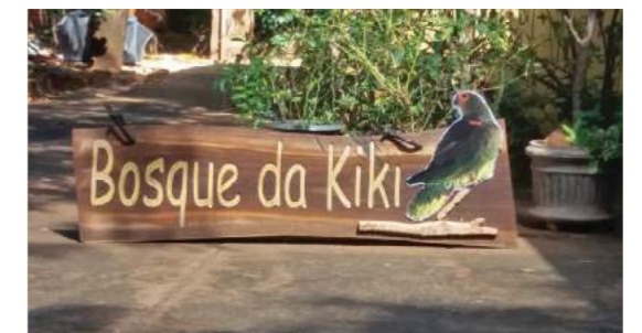
Upper Left: Awaiting freedom in one of the release flights Lower Left: A released bird stays close to the aviaries Upper Right: Trees planted as part of the restoration efforts already bearing fruit for the parrots Lower Right: Donated sign by private funder made in honour of a beloved companion parrot. (Bosque da Kiki stands for 'Kiki's Wood')