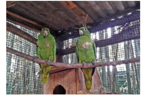
Left: Recently rehabilitated Maroon-bellied Conures post-release Top Right: Conures released in 2015 spotted in 2020 Bottom Right: Chester the Southern Mealy Amazon (left) in the pre-release aviary after a long recovery from a dog bite

This individual could not support its weight and seemed to have a leg or spinal injury. Thanks to intensive feeding and pain management care, the bird was stabilized enough to be brought to the city of Sao Paulo (4 hours away), where Wildvet Clinic is able to treat the most serious cases. A spinal lesion and air sac disease were seen on the lateral X-ray. Nebulisation (medication in vapour form inhaled into the lungs) was added to the treatment begun by Silvana.