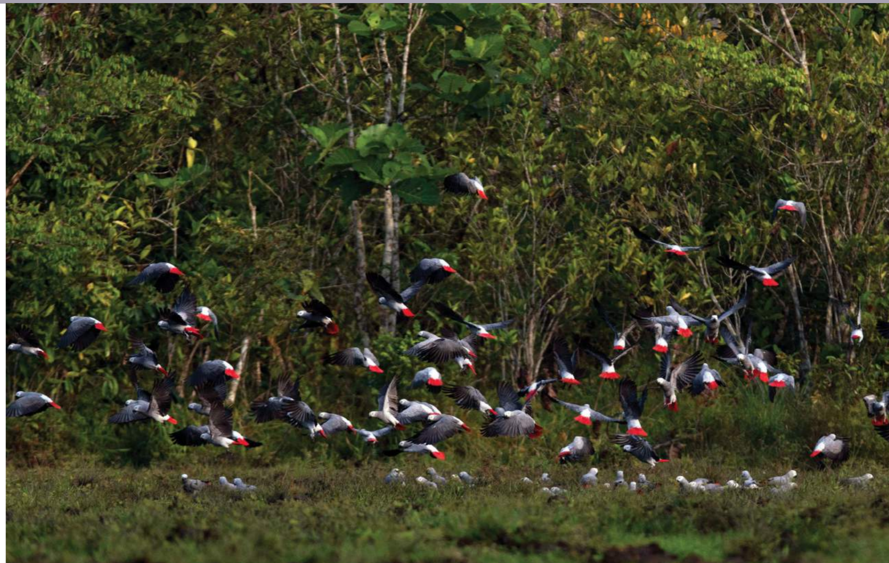
Grey Parrots in Odzala-Kokoua National Park, Republic of the Congo.

In 2017, countries around the world took the collective decision to end the international trade in wild Grey Parrots for commercial purposes by transferring the species to Appendix I of CITES. It was a momentous and vitally important decision.