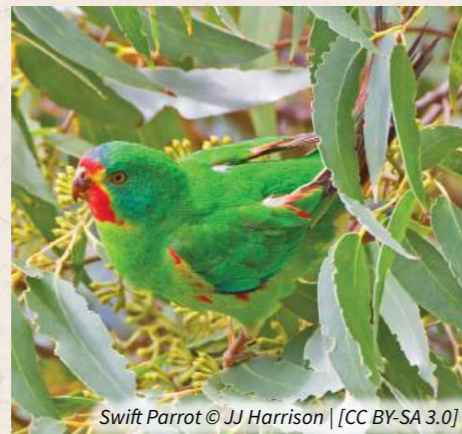
Swift Parrot © JJ Harrison | [CC BY-SA 3.0]