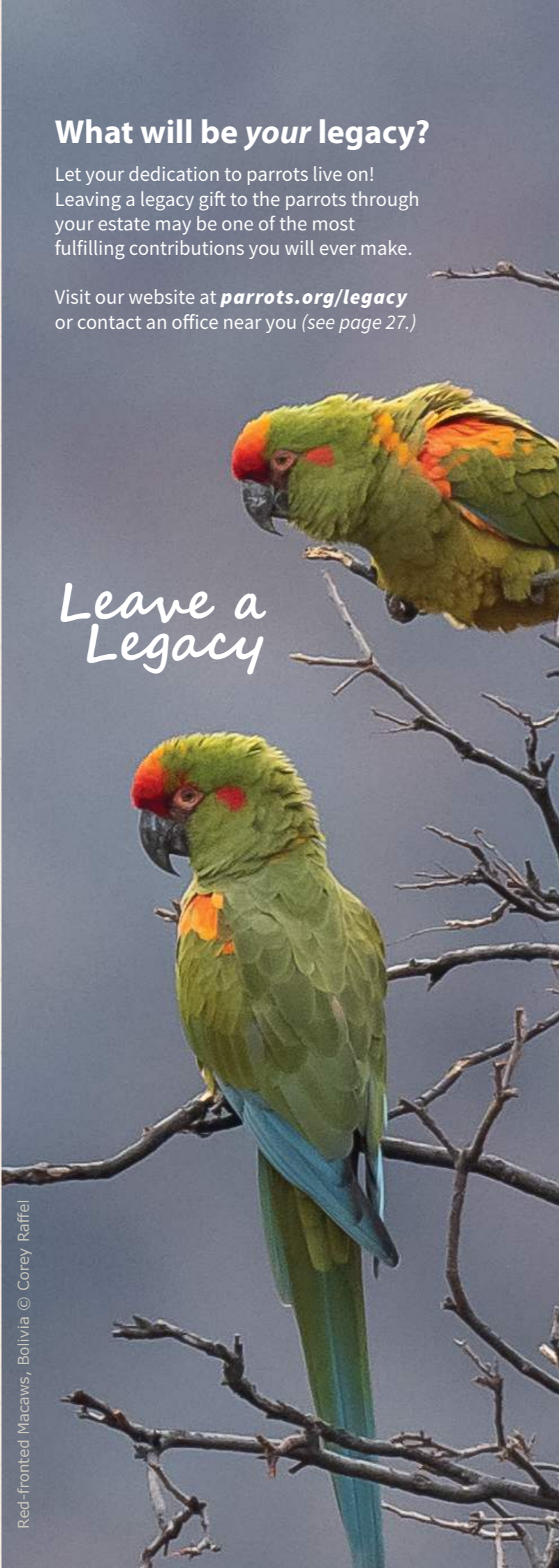
Red-fronted Macaws, Bolivia