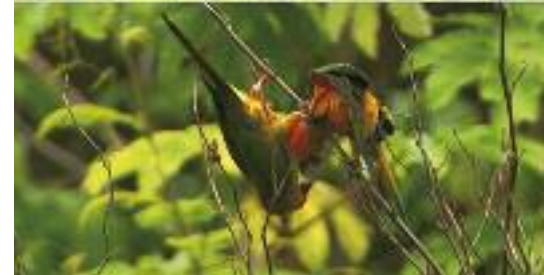
These young birds are mock fighting and seem to have no clue that their family represents about 10% of the known birds of their kind left in the wild.