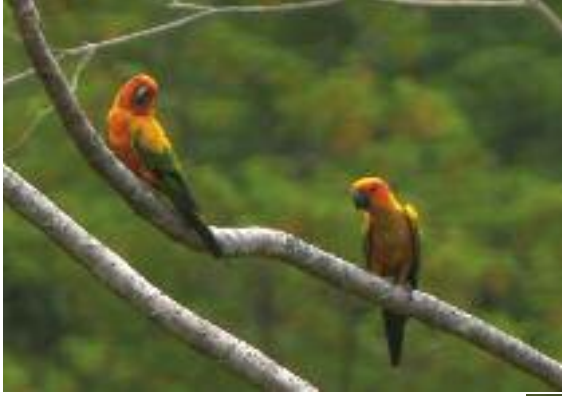
The juvenile Sun Conure, A. solstitialis (above right), has pale green on the throat and chest and less orange on the face and head than the adult (above left). This is important because the Sulfur-breasted Parakeet, A. pintoii , looks like a juvenile A. solstitialis . These similarities and differences were important in the initial confusion which lumped them, and in clarifying the recent split.