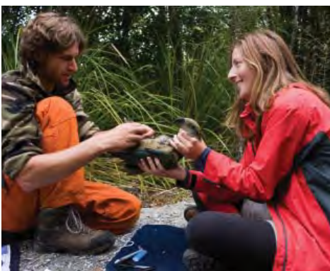
In the hand: A brief physical exam allows fitting of a transmitter. A curious Kea volunteers to be weighed.