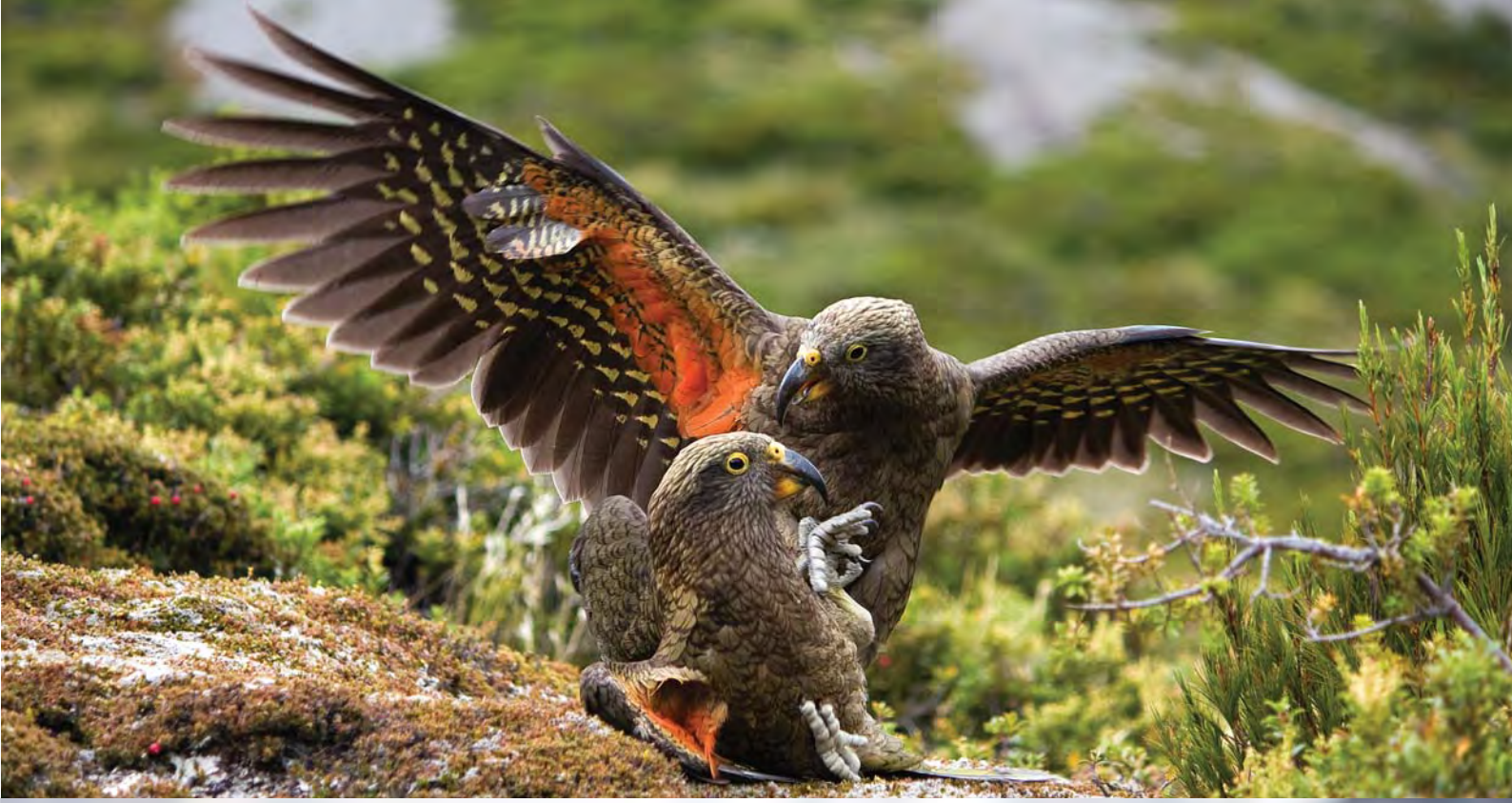
Playtime! The cheeky Kea is famous for its curiosity. Two fledglings tussle in play (above). Another favourite past-time is interacting with tourists, photographers and their vehicles. Kea take particular delight in rubber gaskets, antennas and the like.