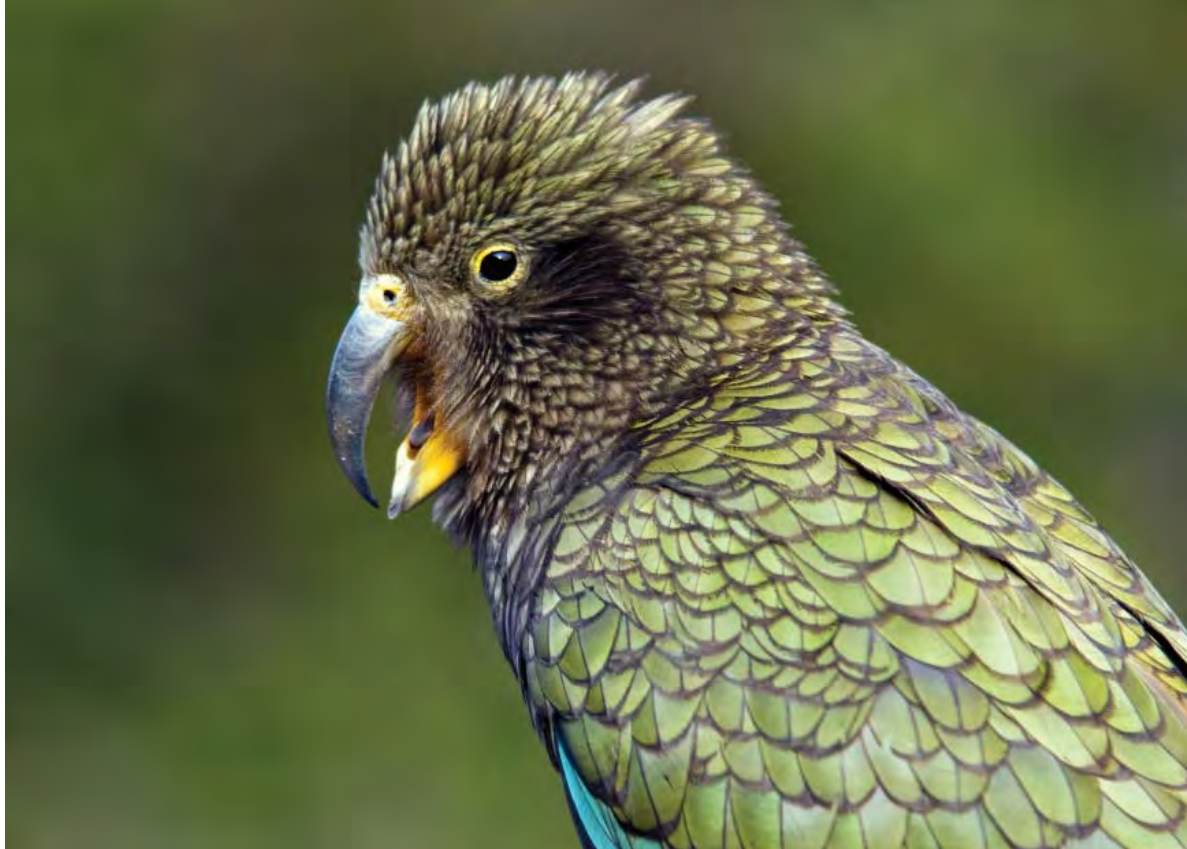
Green on Green: The dual nature of the Kea is reflected in their plumage: striking and conspicuous in motion yet subtle and camouflaging while feeding or at rest.

Even some well-intentioned visitors end up harming the Kea by encouraging their natural cheekiness with nutritionally deficient food and attracting them to human-occupied areas where risks are numerous.