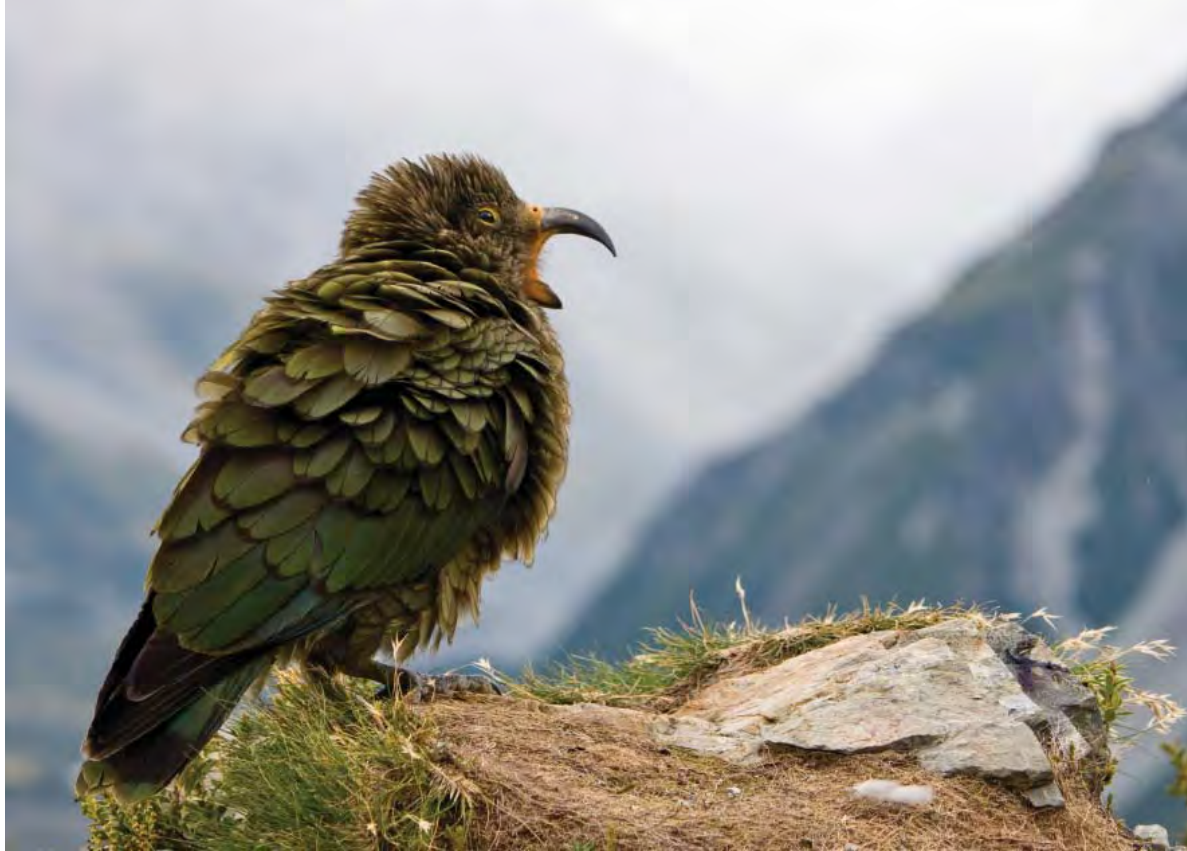
Kea Country: The stunning mountain vistas on New Zealand's South Island are frequently the backdrop for this unique high elevation parrot.

This brief interaction revealed at least two essential Kea attributes. First, Kea are extraordinarily curious. Curiosity is their ultimate weapon against the harsh alpine conditions, where no food source is reliable and no native predators are present. Every novel object in their territory, from one of hundreds of species of alpine plants, a finding of carrion, a tourist car on the side of a mountain road or a hiker on a high ridge, is a potential source of food or entertainment. Second, Kea are highly unpredictable. One moment they are loud and flashy, earning the nickname of “the clown of the mountains.” A second later, they can be silent as a rock, blended into the native vegetation and practically impossible to find.