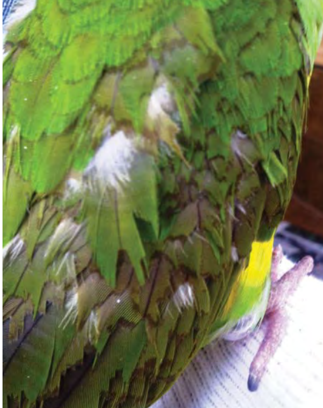
Feather destruction may include pulling feathers out completely with the beak or feet, chewing them off at the body, snipping away small pieces (barbering), or shredding the barbules off of the central shaft.

The overall amount of fats and carbohydrates in the diet must be limited. Parrots are instinctively “programmed” to load up on these foods. This serves them well in the wild, where energy expenditures are significant. However, in captivity these same parrots easily become carbohydrate “junkies” demanding daily their ration of white rice, mashed potatoes, fruit and pasta. The best rule of thumb is to avoid feeding any food that contains white flour, that has any form of sugar listed in the first five ingredients, or that contains any trans fat. Very sweet fruits, such as bananas and grapes, should be avoided in favor of those that offer better nutrition, such as berries.