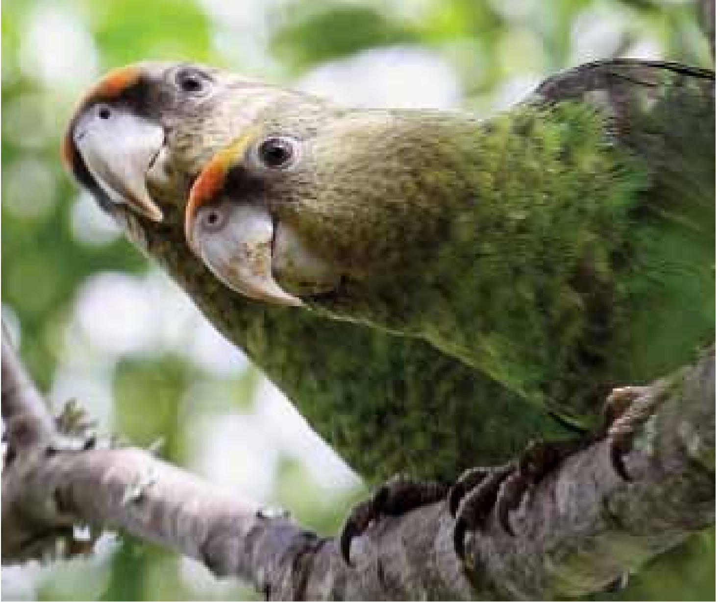
(left) A 1,000 year old yellowwood tree now stands alone. There are only three yellowwoods this size left on earth.

thousands of Cape Parrots frequented these ancient forests, busying themselves like honeybees, moving from feeding patch to feeding patch, dispersing thousands of yellowwood fruits to the ground to kickstart the next generation of forest giants. The fate of these charismatic parrots was linked over thousands of years of mutual benefit to these grand forests. Or was it?