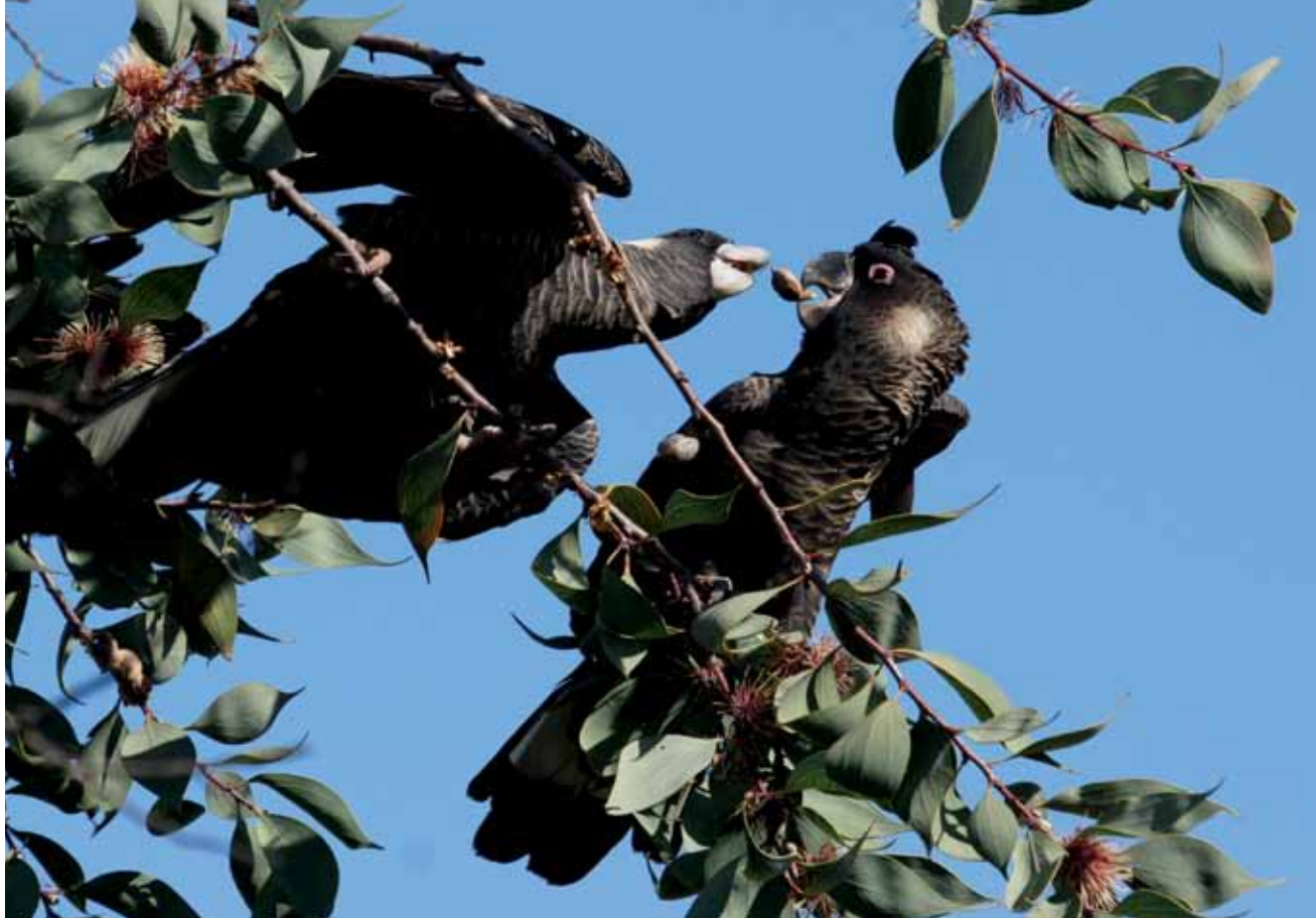
The male Carnaby's Black Cockatoo has a pink orbital ring - the female's is dark grey. He passes a seed to her from a native Hakea tree.

calls. Their bright white or vivid red tail feathers contrasted with black plumage make them spectacular. You can't miss their large chorusing flocks! They do sometimes wreak havoc in gardens or orchards and leave quite a big mess behind after feeding, especially when they gather in large numbers (sometimes reaching 1000 or more individuals).