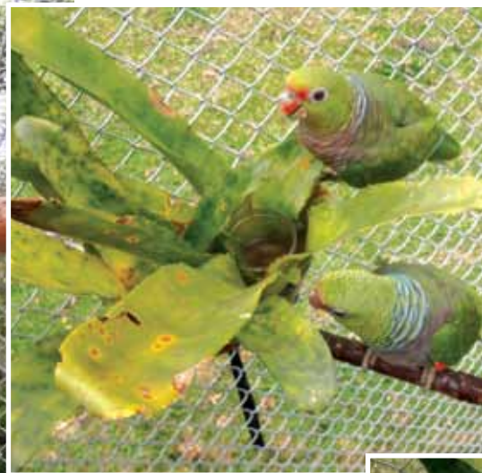
While the birds are allowed free access to the release cage and feeding stations post-release they are also taught to recognize natural foods and sources of water. Many begin foraging immediately after release.