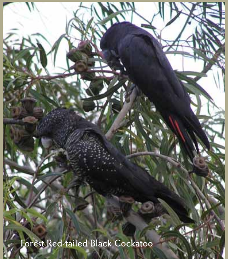
Forest Red-tailed Black Cockatoo