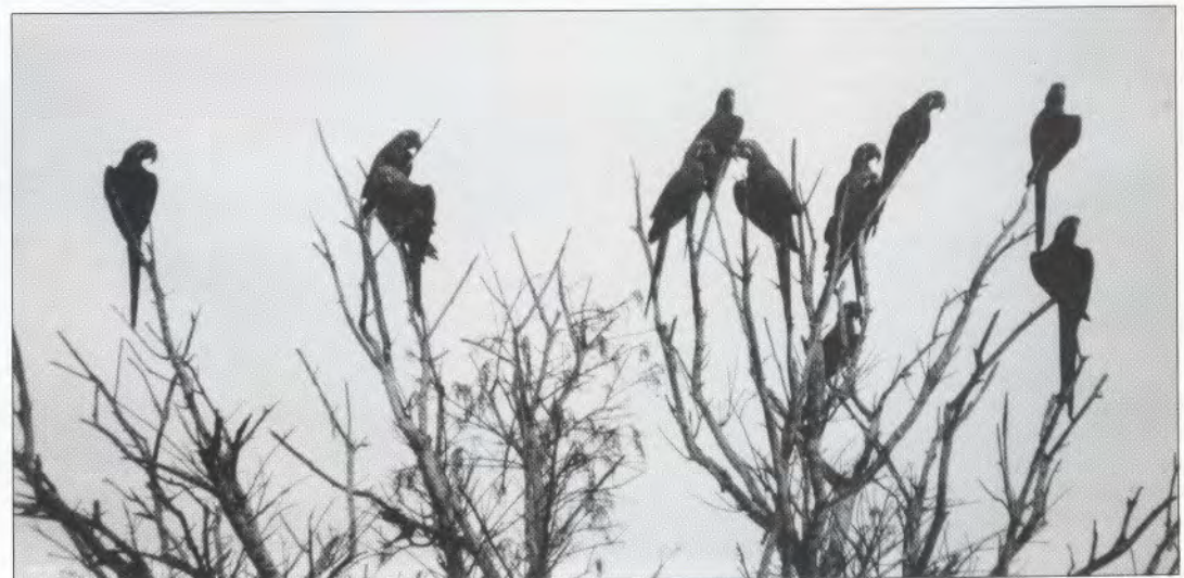
Parrots in the wild: Hyacinth Macaws at a typical roost.