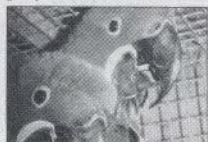
Stolen to order?

Police were alerted immediately. During routine checks of vehicles in Cambridgeshire, all five birds were discovered in the boot of an Audi. Two men have been released on police bail and a third has been remanded in custody pending trial. Police are still investigating the theft of the first group of birds.