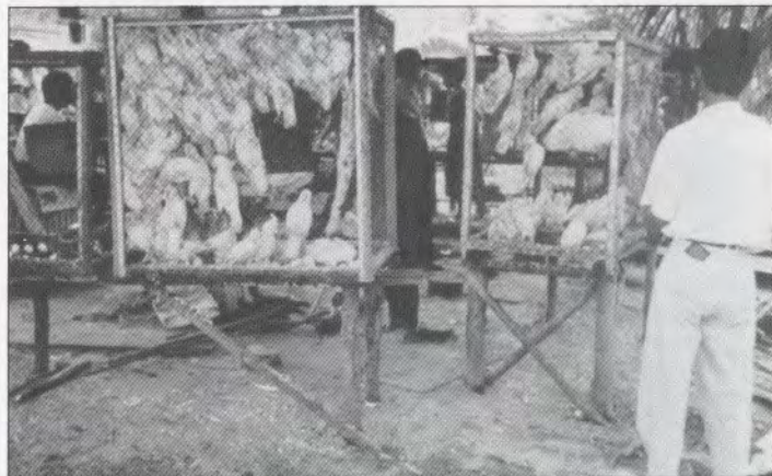
Captive Goffin's Cockatoos, held in cages on a farm near Saumlaki, Tanimbar, Indonesia. Over 500 were kept there for one year.

We will keep our members informed on future developments on Tanimbar. What is certain is that the Trust will think very carefully before it allows itself to get involved in a similar situation in the future. From the parrot welfare point of view it was rewarding to have 319 cockatoos removed from miserable conditions and returned to the wild, but it has to be conceded that insufficient science was applied to the release.