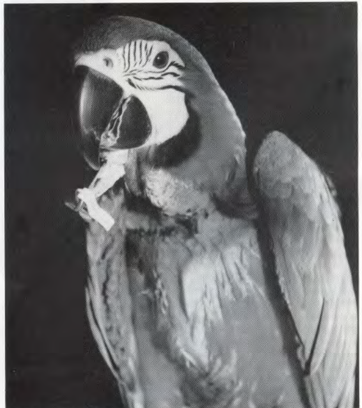
Stacy - 5 month old Blue/Gold Macaw with massive crop burn.

This dreadful story illustrates the fact that young hand-reared parrots should not be sold until they are fully weaned. Ed.