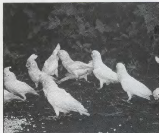
The Goffin's Cockatoos pick up food from the forest floor.