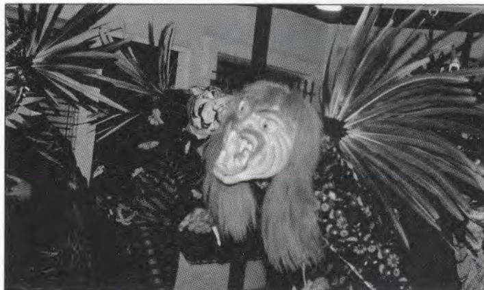
Panamanian dancers using macaw feathers.