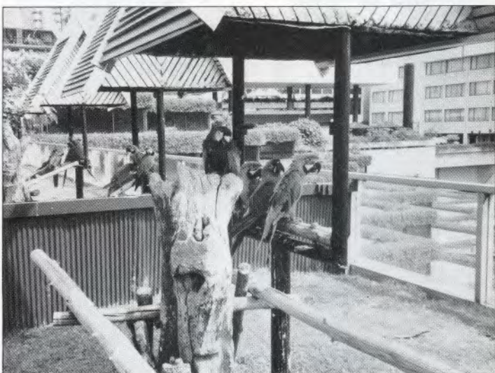
Parrots at Ambassador Hotel, Bangkok.

Another member writes to us about a large group of parrots being used as part of the decor of the Ambassador Hotel, Bangkok. The photograph shows a small section of them, including Scarlet and Blue and Gold Macaws. Palm Cockatoos and Hyacinth Macaws are also there, making up a total of over 100 birds. In March we wrote to the managing director of this hotel to ask how the birds came to be there, and if they have any plans for putting the endangered species into breeding facilities. No reply so far, which is not a surprise. If any reader wishes to add his or her voice to our enquiries, write to: Managing Director, Ambassador Hotel, SO1 11-13, Sukhumit Road, Bangkok, Thailand.