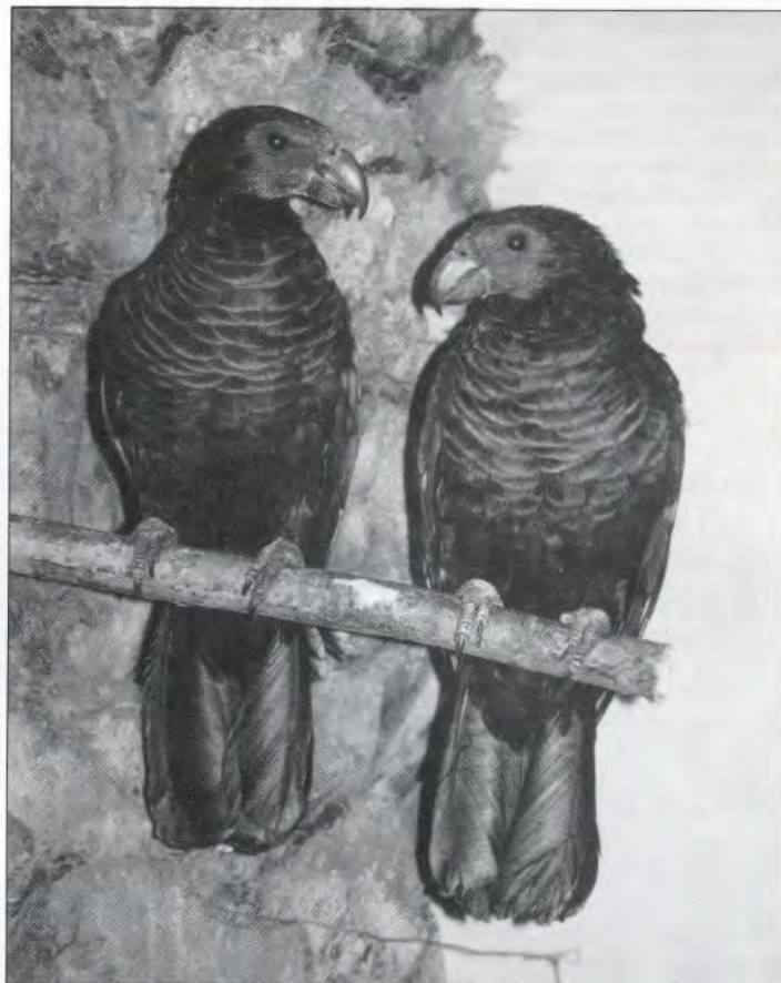
Breeding pair of Pesquet's Parrots at Palmitos Park

I know of only seven collections which have ever reared this species. I have been extremely fortunate to have worked with, and reared young, from two of those pairs, first at Loro Parque and now at Palmitos Park. I have learned what I believe are the two most important factors in breeding success. One is the provision of a log which the pair can excavate themselves; the task of excavation is, in my opinion, the most important breeding stimulus. In the Canary Islands, palm trunks about 2m high provide ideal nest sites. Secondly, because of the aggressive nature of some males, constant surveillance is essential. A video camera monitors the behaviour of our pair at all times. There is a monitor in front of the table where I spend many hours working. On two occasions this allowed me to intervene when the male launched attacks on the female which would otherwise