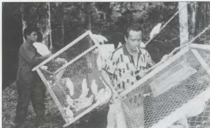
Goffin's Cockatoos being released into the forest. The release was made under the supervision of the local Indonesian authorities.