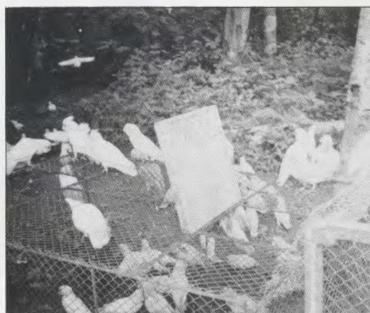
The freed Goffin's Cockatoos begin to fly to freedom.