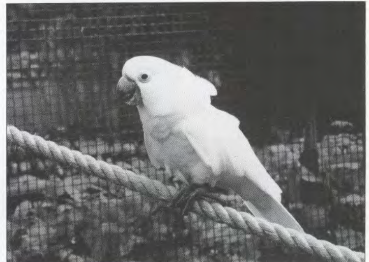
Parrot in captivity: A rare Blue-eyed Cockatoo demonstrating his preference for a rope perch.

What did we ever do to deserve this? For millions of years we flew free, evolved into hundreds of ingenious and beautiful designs to fit in with nature's plan, took our chances in a thousand wild places and succeeded despite every adversity. Then, in just a few recent moments of recorded time, we became the most sought after, most valuable birds in the world. We are traded like rare jewels, we are smuggled and even stolen. But we are not inanimate objects, we are living creatures with special needs. Above all we are birds and we need to fly. Those of us which are still free, please leave us free. For those many of us in captivity, I must ask for us to be treated with compassion and respect.