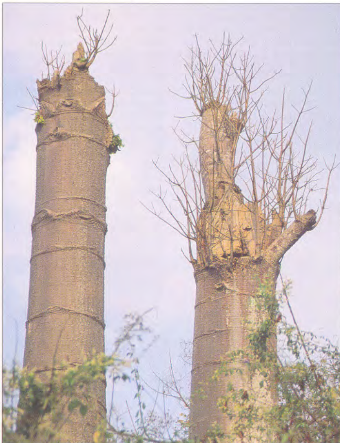
Buffon's Macaw nest in Pigío tree ( Cavanillesia platanifolia ).

In regard to the most effective use of funds and other aid for the conservation of guayaquilensis , Buffon's macaw reflects very well the situation of many other psittacids, which is that we have virtually no detail on its ecological requirements and life-cycle to confidently formulate and implement conservation management plans. To get this information, it seems to make sense right now to concentrate efforts on an area with guaranteed protection, an existing infrastructure which can greatly assist the collection of valuable field data as quickly as possible. Thus, within the BPCB, identification of other active nest-sites is necessary, as is the scientific monitoring of these