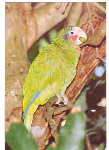
Cayman Island Parrot, ( Amazona leucocephala caymanensis ).

About 80 birds are registered but only 7 Cockatoos are captive bred and not so good breeding