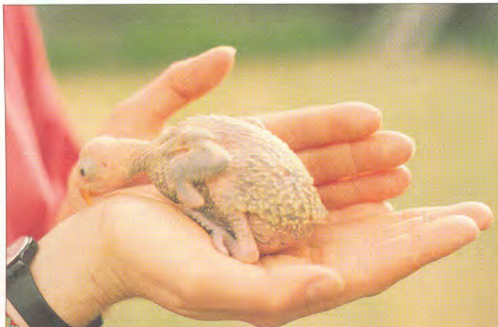
13 day old Echo.