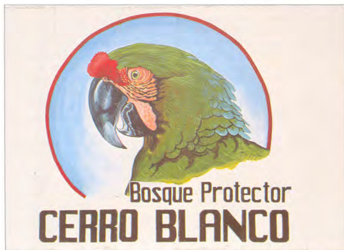
Sign at main entrance BPCB, Guayaquil, Ecuador.

Based on the above information it is recommended that funds and other resources are first directed to ecological studies and conservation management actions for guayaquilensis in south-west Ecuador, specifically starting with the Bosque Protector Cerro Blanco