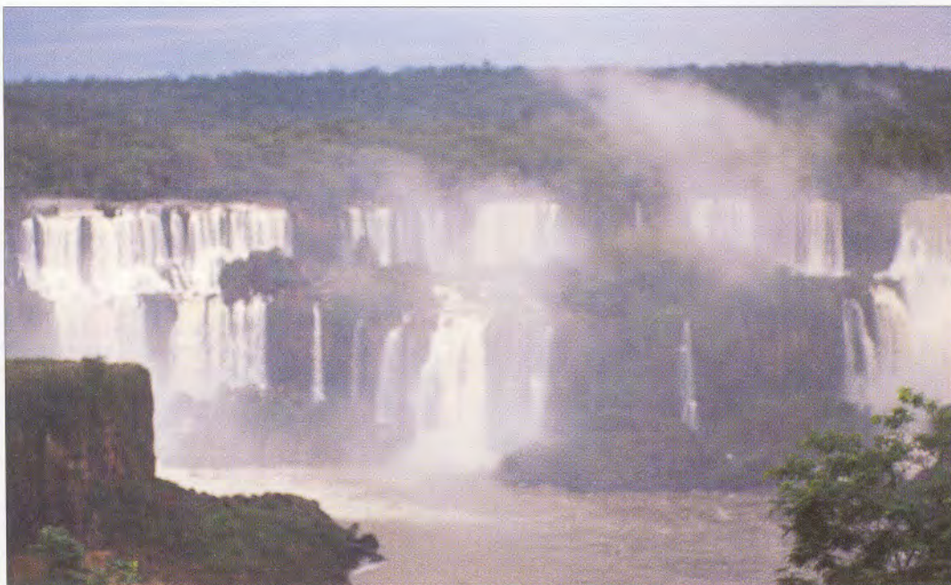
Iguacu Falls at the junction of Paraguay, Brazil & Argentina.

The Iguacu falls are reached by crossing the Parana river into Brazil. They are situated within a