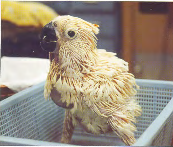
This Moluccan Cockatoo was the first successful hand-reared chick in Japan in 1988.