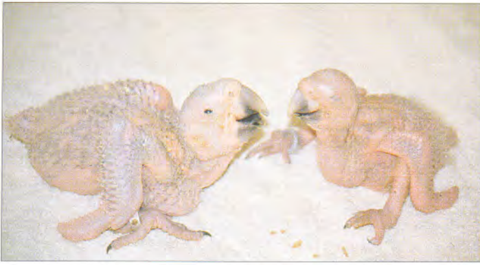
Ara ambiguus at 16 & 10 days.