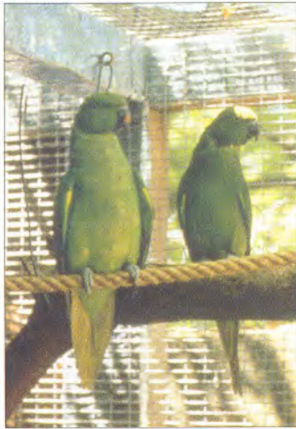
Pair of adult Echos in Mauritius aviary.

This year we are pleased to report the most productive season for the Echo Parakeets since the mid 1970's. We began the season with four pairs in the wild and one in captivity. All started breeding early, perhaps in the wild birds in response to abundant food supply following a flush of growth after last February's big cyclone.