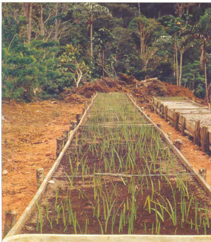
The palm nursery at Bahia, Brazil.

Quite a schedule, but it resulted in considerable progress on every matter affecting the conservation of Lear's Macaw. In a later issue of this newsletter we will cover the actions resulting from Charlie Munn's trip. In the meantime, our top priority is securing the substantial funds required to allow our work to continue.