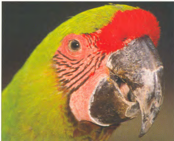
Buffon's Macaw, Ara ambigua guayaquilensis .

Originally 2,000 ha in area, the BPCB has recently been extended