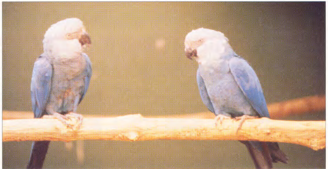
Spix's Macaw at Sao Paulo Zoo; the male on the left, has a different head and beak shape.

Asuncion Zoo itself is in a fairly dire state. Founded in the 1930's by an expatriate from Hamburg, its buildings are small, badly constructed and hopelessly out of