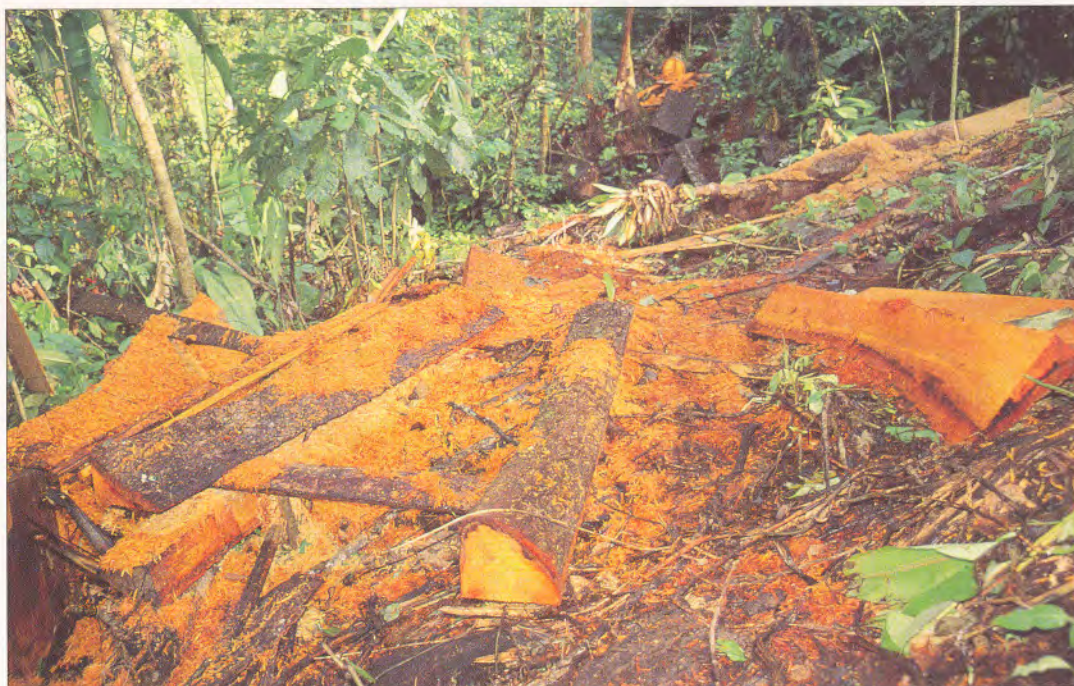
Effect of timber felling in wet tropical forest, San Juan, Esmeraldas, Ecuador.

It will of course consider articles or letters from any contributor on their merits.