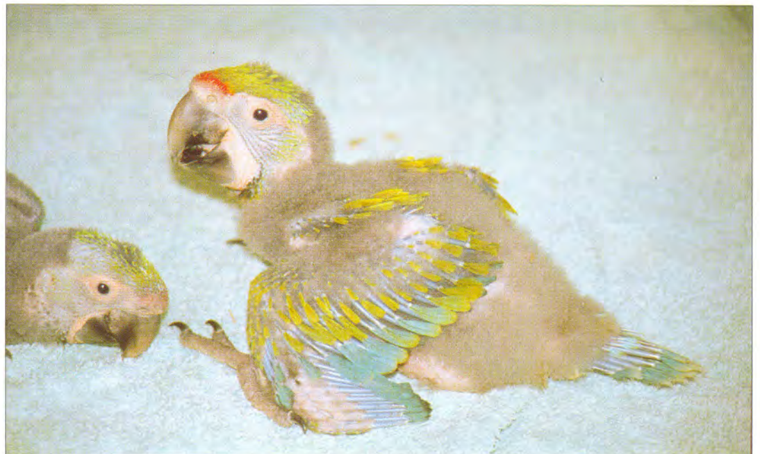
Ara ambiguus at 37 days.

On December 3 it was removed from its parents and placed in a much larger aviary with some Military Macaws Ara militaris . Three of these had been hand-reared. As I had just removed them from the hand-rearing room I continued to feed them warm rearing food from the spoon once daily. I also handed them cracked