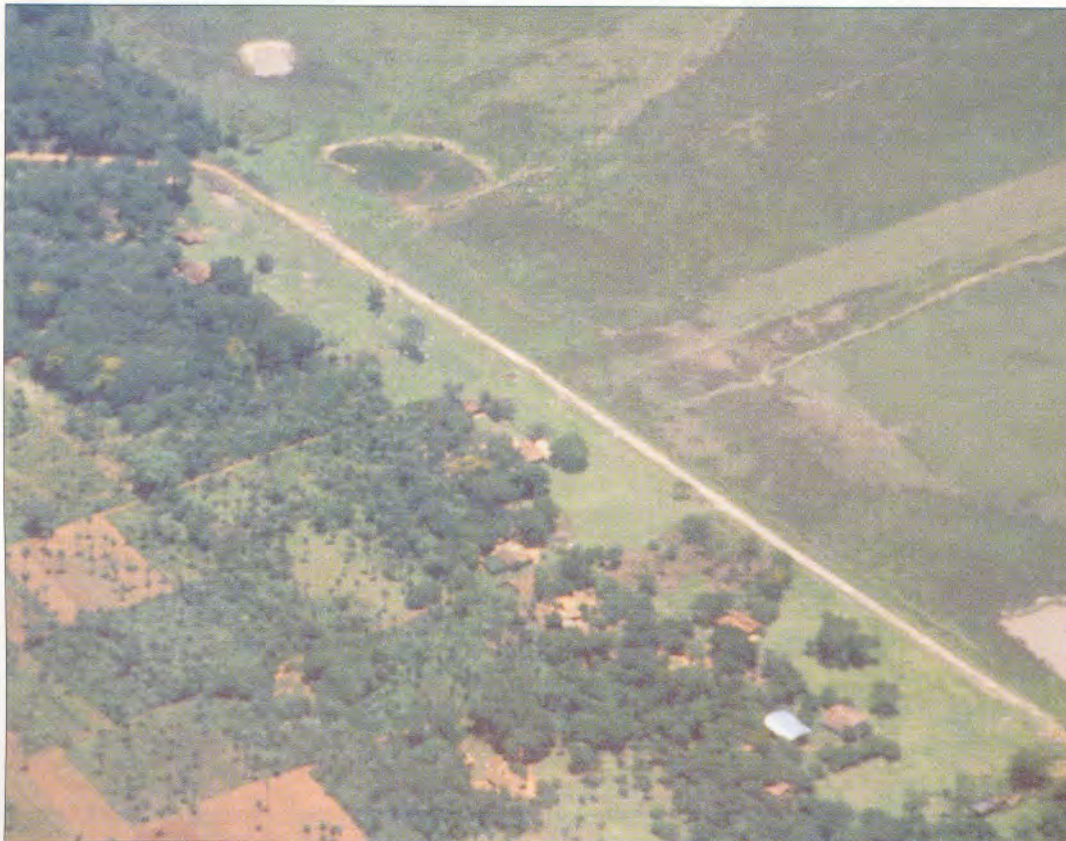
Roadside forest remnants, Paraguay.