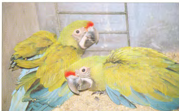
Ara ambigua at 68 & 62 days.

Three days later I had to remove the second young Buffon's which was found to be quite thin.