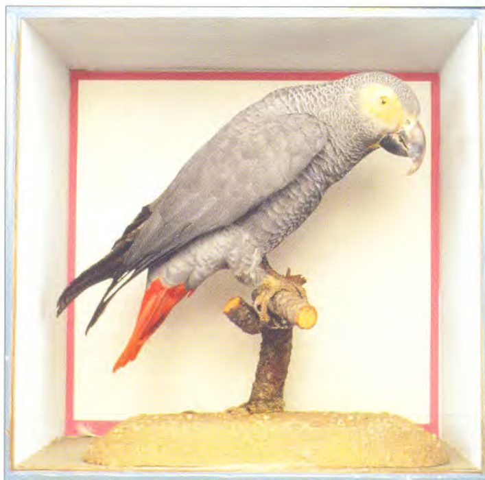
Houdini's African Grey

resided at the American Museum of Natural History in New York City.