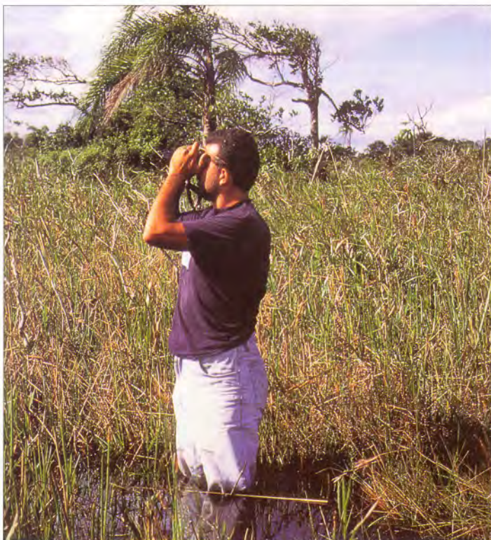
The author deep in the swamp that covers much of the Red-tailed Amazon's territory.

Hunting amazons for food still takes place. In São Paulo I recorded two instances. One case involved children killing a bird with slingshots. The other occurred at Cananéia in June 1990, when 40 birds from a roosting flock of 87 were shot by local caçaras for target practice and food.