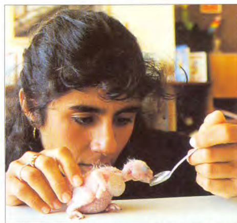
Healthy as a Parrot. A trainee biologist from Peru feeds a St Vincent parrot chick at Paradise Park, where the birds are captive-bred and hand-reared.

Hit by hunting, habitat loss and occasional hurricanes, the Jacquot's numbers are believed to have dropped from an estimated 1,000 birds in 1950, to only 100 in 1975. It was this decline which spurred conservationists into action. In early 1990, David Woolcock, curator of Paradise Park in