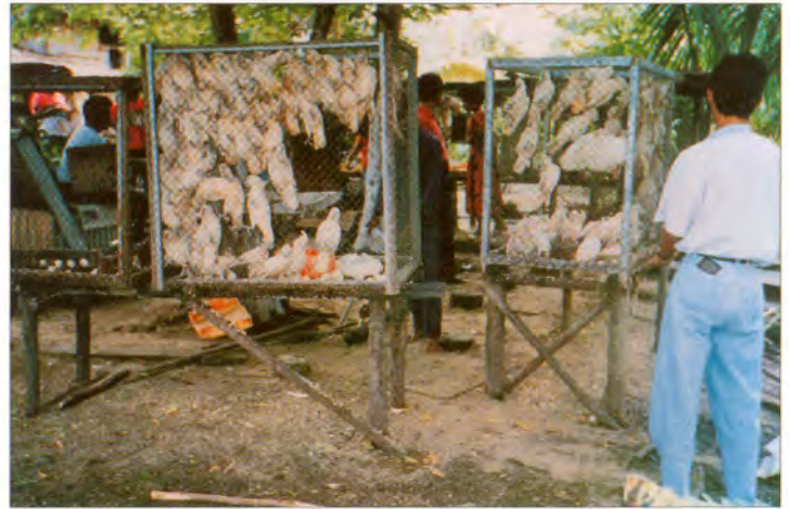
Wild caught Goffin's Cockatoos, Tanimbar, Indonesia. Many of these birds died, but the WPT managed to get 300 released.

The next development in the history of the parrots is probably the most profound: the discovery, refinement and dissemination of the techniques required to breed them in captivity. This was a cumulative process, with spasmodic breedings occurring, mostly in private collections, from the 1920's to the 1960's. A major factor inhibiting breeding success was that almost all parrot species are not sexually dimorphic, i.e. not capable of being sexed visually. Since most parrots, if kept as a 'pair' of the same sex, will for social reasons behave rather as if they were a true pair, this depressed early success in breeding parrots in captivity. In the late 1970's the use of laparoscopy to establish conclusively the sex of parrots came into use, and this rapidly transformed the prospects of success. At last, pet parrots of previously unknown sex could be paired up with certainty, kept in aviaries, provided with nestboxes, given more adequate nutrition, and might then reward their owner with some chicks.