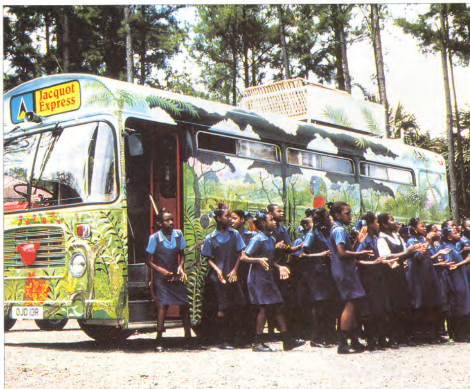
Big trip to birdland. St Lucian schoolchildren get ready for an experience on the Jacquot Express. The Caribbean island is "a nation sensitised to the importance" of an endangered species.

The solution was not conventional captive-breeding and release into a reserve, but a programme of travelling to the towns and villages of St Lucia to educate local children. The Jacquot Express was born, with impressive results. St Lucians have embraced the Jacquot as a national emblem, and government hunting bans and forest protection have been enforced with local support. The ICBP/IUCN Birds Red Data