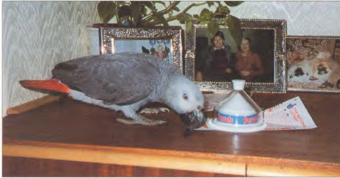
Dudley busy selecting his numbers for the National Lottery.