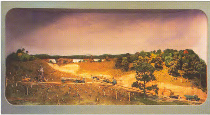
Working model of the 'bad forest'.

Remanso bridge, the bridge which crosses the River Paraguay into the Chaco region. Once seized, the birds had been placed in the care of selected individuals who undertook to rehabilitate the birds prior to re-release back into the wild. The lady was merely moving the birds from a small aviary at her home to a larger one at her mother-in-laws, albeit in a rather unorthodox manner!