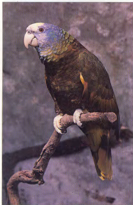
Vincie the vulnerable. The St Vincent parrot is one of at least four endangered Caribbean parrots now being rescued through public education projects.

Book now estimates that there are 300-350 St Lucia Parrots on the island, and "a nation sensitised to the importance of the species."