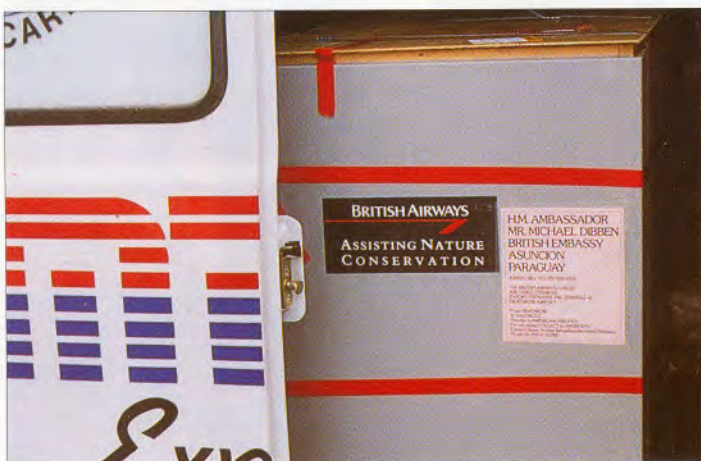
Loading the bus exhibits for shipment to Paraguay by British Airways.

A rather surprised but very nice lady, who incidentally, spoke excellent English, explained to us exactly what she was doing ..... The Blue fronts had been taken from the wild in the Chaco region of the country and had been confiscated by the CITES authorities when they were discovered for sale at the