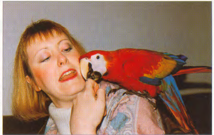
A captive-bred, hand-reared parrot can be a companion for life.

The essential fact remains, however, that about 100 of the 330 species of parrot are threatened by