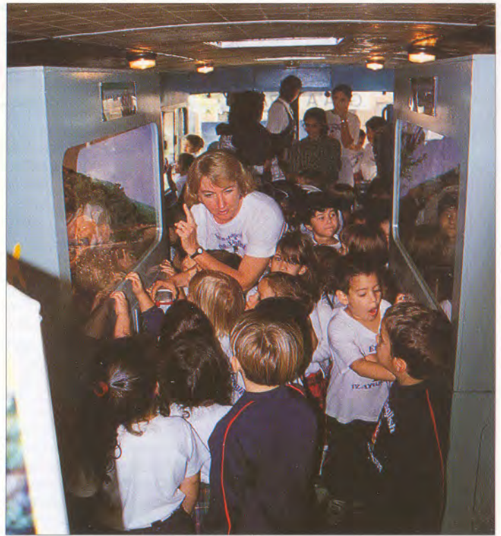
Local children on their way through the bus.