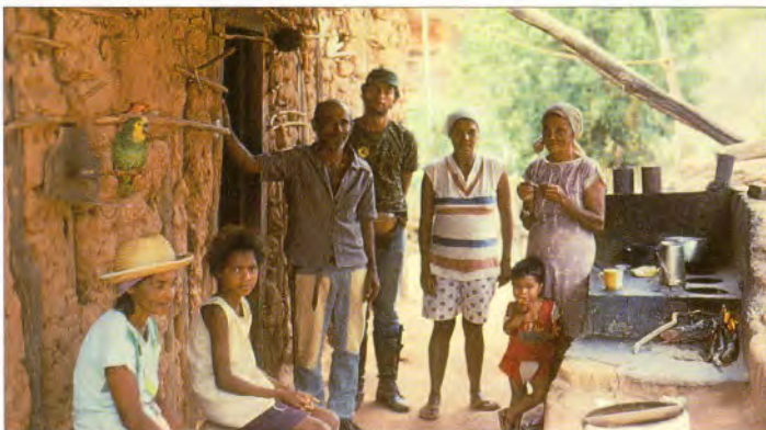
A pet parrot is part of life in developing countries.

No other family of birds attracts this degree of interest and investment. The reason is simple: parrots are money. When a quite 'ordinary' parrot can be sold for $1000, and a very special one for $20000, the whole affair ceases to be a hobby and becomes a business. In the world as it exists