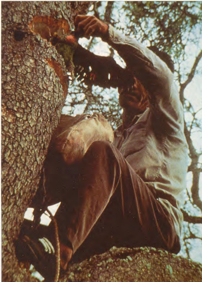
A trapper takes a Blue-fronted Amazon chick from a wild nest. The chick will probably die, the nest tree may survive. Research shows, however, that over 100,000 nest trees have been destroyed in Argentina alone.

With fifty million parrots kept as pets, and perhaps another five million breeding birds in aviaries, the parrots of the world are also a resource for conservation awareness that has not yet been tapped. In addition to expanding its field conservation work, the trust intends to develop education projects aimed at establishing the parrots as the logical 'spokespersons' for the whole of nature. Only by encouraging future generations to protect and preserve our natural heritage can we hope to ensure the future of all species, including our own.