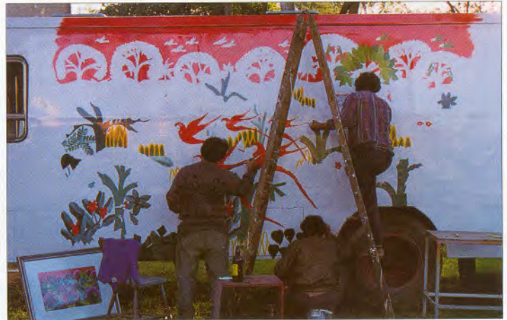
Painting the Ecobus in Asuncion