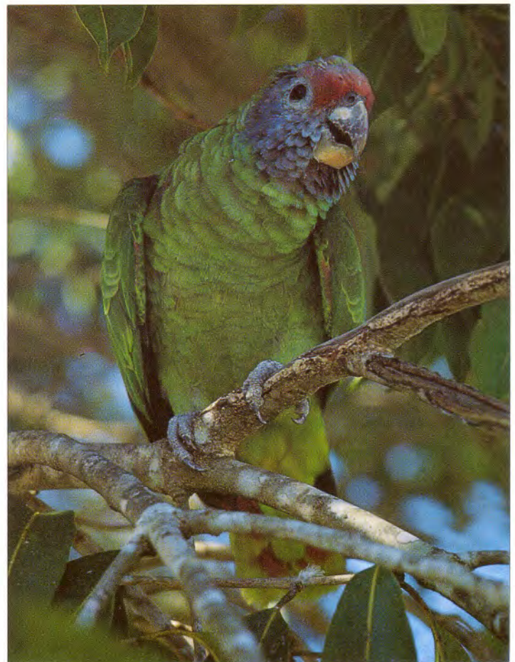
Red-tailed Amazon A. brasiliensis .

Most records were of fruits (88.7%), both pulp and seed being eaten in most instances. Flowers and nectar accounted for 9.8% of the records, the amazons selecting species with abundant nectar that also attracted other birds like