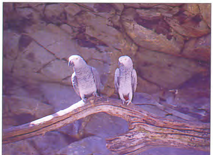
Trade in wild-caught Grey Parrots may soon be illegal in South Africa. Aviculturists should be able to meet the demand for young birds as pets.