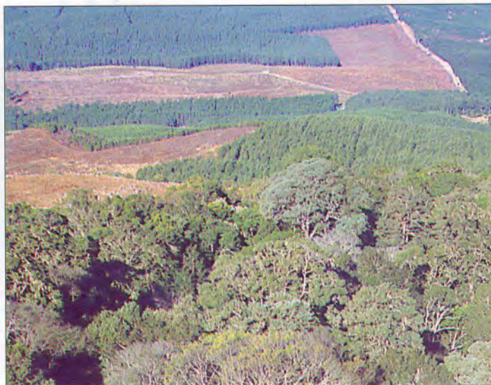
The small area of yellow-wood forest (foreground) is surrounded by agricultural land and pine plantations.

I was shocked to realise how small was their surviving habitat, and how vulnerable they are. It is one thing