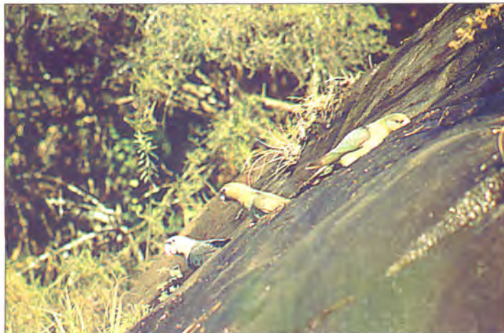
Cape Parrots fly from their perches into the scrub on a slope. They are on their way to a rock pool, fed by a small stream.

General findings with conservation implications include the importance of the yellow-woods to Cape Parrots. These trees are long-lived, and often the tallest trees in the