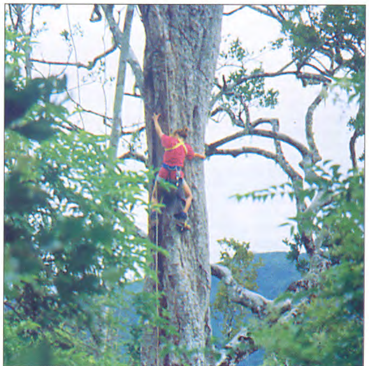
A member of the Mauritius team climbs to inspect a nest cavity.

Here's hoping the good season continues. Further updates will be sent as the season progresses.