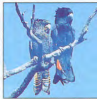
Red-tailed Black Cockatoo