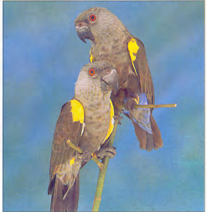
Captive-bred Rüppell's Parrots belonging to Ron and Val Moat.

Both birds have 1992 rings; they are very compatible with a playful nature. But the male is very quick to attack the hand that feeds him when there are chicks in the nest. Observation of the cage is by closed circuit television. Eggs were seen on December 11, 13 and 19. Chicks hatched on January 8 and 14; one egg was infertile. The chicks were ringed at 17 days with a 7mm ring. They weighed 116g (35 days) and 99g (29 days) on February 12 and 123g and 115g seven days later. On March 8 (at 58 and 52 days) the young ones were seen out of the