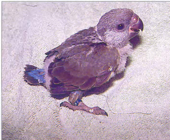
Parent-reared Rüppell's Parrot aged 40 days.