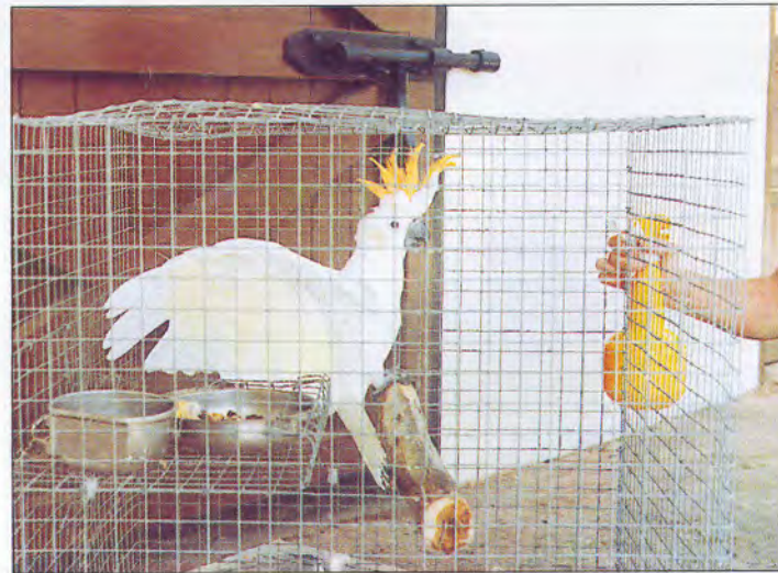
Year round daily misting with plain water is essential for health and feather condition.

Some people drive their parrots crazy. Teasing, aggressive behaviour, continual confrontation, or constant arguing from humans can cause insecurity in parrots that could lead to picking. Our major goal for our parrots should be to help them to be secure in our