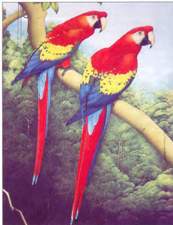
SCARLET MACAW - Limited Edition Print