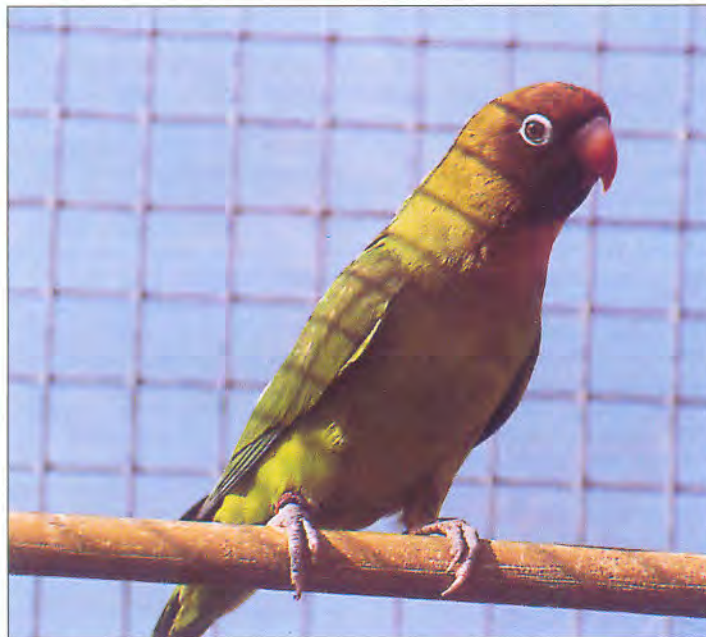
The Black-cheeked Lovebird is Africa's most localised parrot.

If you are interested in the biology and conservation of African parrots, please contact Mike Perrin at the Research Centre for African Parrot Conservation, Private Bag XO1, Scottsville, 3209, Natal, South Africa.