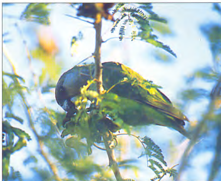
Although the Brown-headed Parrot is described as common in South Africa, little is known about it in the wild.

3. To determine if Brown-headed Parrots are co-operative breeders. It is not known if younger birds from previous seasons stay on, and help their parents raise new chicks (co-operative breeding), before dispersing and finding their own nest-holes and territories. Answering these questions will require capturing, taking blood samples from and colour-tagging birds so that individuals at nests can be identified. Social organisation is likely to be important and may be