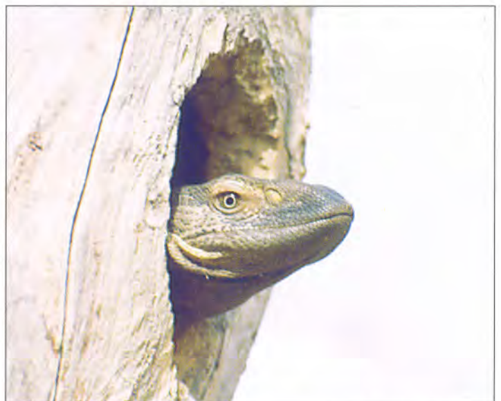
Rock Monitor Lizard Varanus exanthematicus in a tree cavity - They climb very high trees, using their sharp claws, and raid the nests of birds, including Rüppell's Parrot.

Lastly, I urge anyone buying a Rüppell's Parrot to make sure that it is captive-bred. It should have a closed ring of the right size (illegal traders have been known to force closed rings onto the feet of adults). It is surely worth paying extra for a captive-bred bird in order to allow the continued survival of this species in the wild.