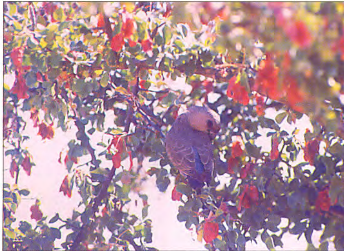
Juvenile Rüppell's Parrot preening after feeding on the red pods of Terminalia prunioides .

I have therefore started a field project to provide such information to the Namibian government,