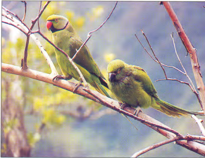
Echo Parakeets in the wild: male on left, female on right.

2. First clutches are removed from selected breeding groups with the purpose of initiating double clutching. The progeny from these harvested clutches will either be hand-reared or raised by Ringneck