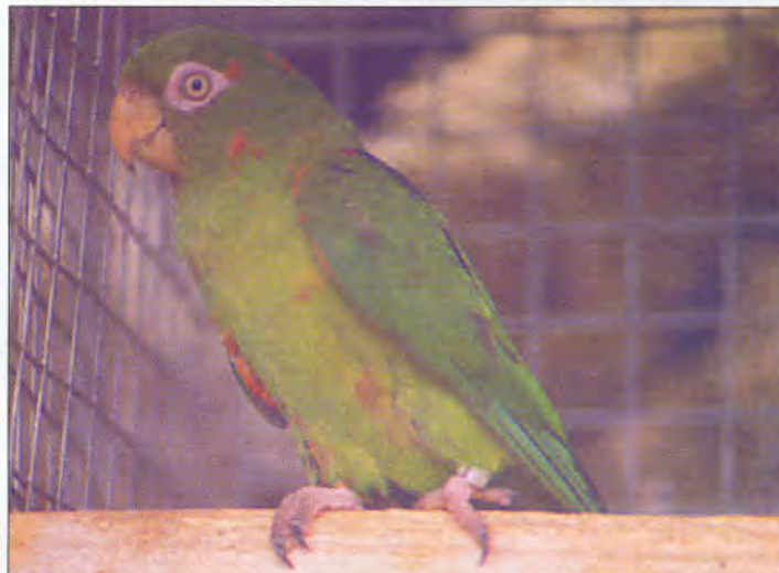
The Cuban Parakeet or Conure is rare in the wild and in aviculture.

Without a conservation programme based on sound biological data, this species will likely undergo further