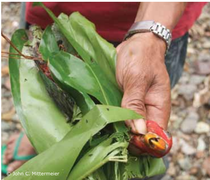
A parrot trapper with a recently trapped Chattering Lory on Obi Island, Indonesia.