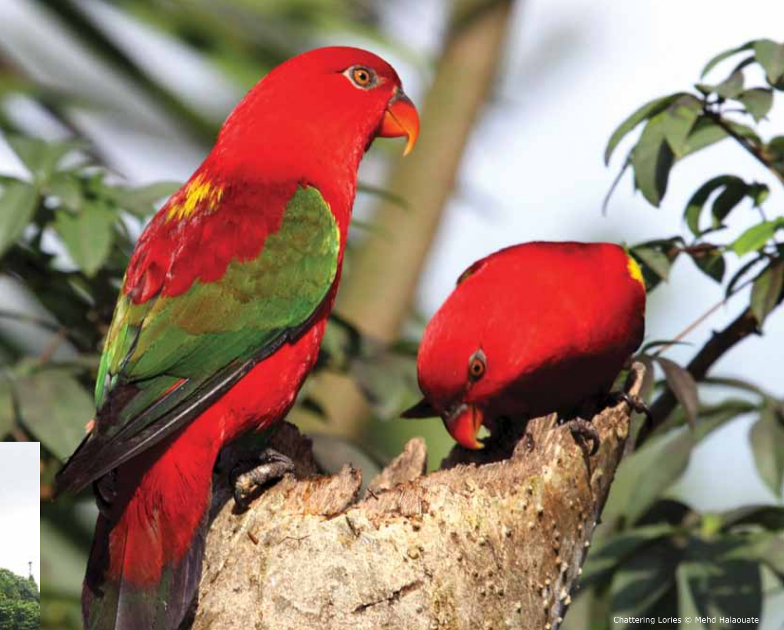
Chattering Lories

SITUATED BETWEEN SULAWESI AND NEW GUINEA, THE NORTH MOLUCCAS ARE AN OVERLOOKED but richly biodiverse group of islands in Eastern Indonesia. They achieved fame amongst 16th century Europeans as the origin of valuable spices, specifically cloves and nutmeg, and then again in the 19th century for their role in inspiring Alfred Russel Wallace and his theory of evolution. Today they are home to many endemic plants and animals, and parrots are no exception.