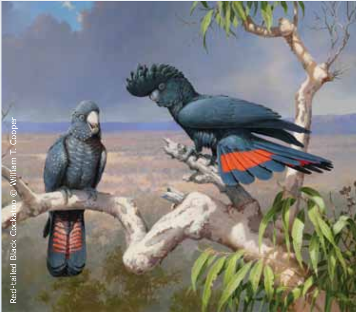
(opposite page) Eastern Rosellas as depicted in north-eastern New South Wales. (top left) The Red-tailed Black Cockatoo as seen in North Queensland. (top right) Morning on the Moor Yellow-tailed Black Cockatoos as viewed at Myall Lakes on the mid-north coast of New South Wales.