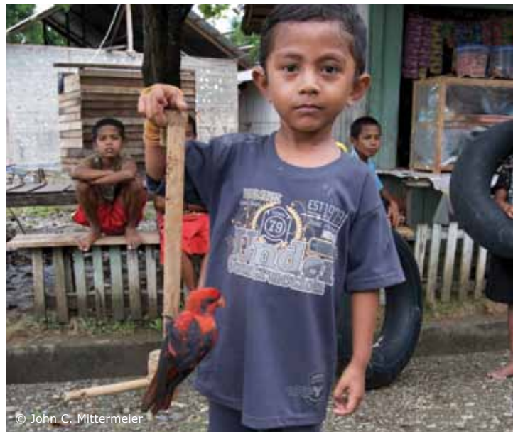
© John C. Mittermeier A young boy with his pet Violet-necked Lory ( Eos squamata ) in Kampon Buton village, Obi Island, Indonesia.