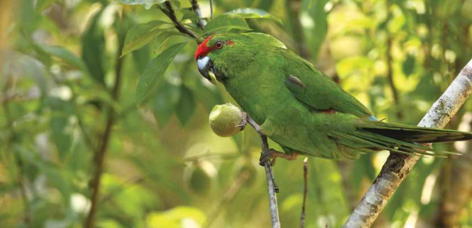
A Tasman Parakeet nimbly balances as it feeds on local fruit

Nowadays, only about 10% of the original forest that covered Norfolk and its outlying islands persist. The reason for this is clear: the colonisation of this land by humans, as in other places around the world, caused dramatic changes in the diversity and structure of pre-human ecosystems. During the late 1700's Phillip Island served as a breeding ground for exotic mammals consumed by settlers: pigs, goats and rabbits. In a few years, these voracious grazers devastated the unique vegetation that took thousands of years to assemble.