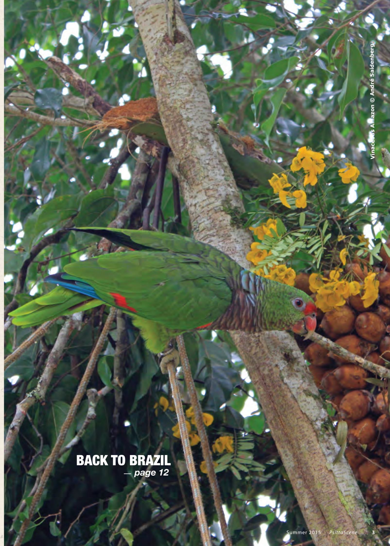
Vinaceous Amazon

BACK Mitred Conures ( Aratinga mitrata) feeding on persimmon fruit. Native to Argentina, Bolivia and Peru, introduced flocks also thrive in many locations within the United States, including California, Florida and Hawaii.