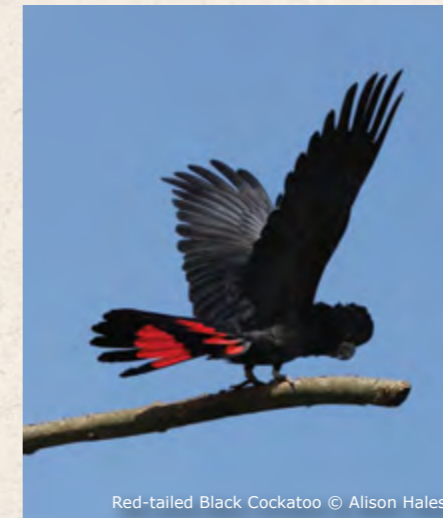
Red-tailed Black Cockatoo

Learn more: kaarakin@kaarakin.com blackcockatoorecovery.com