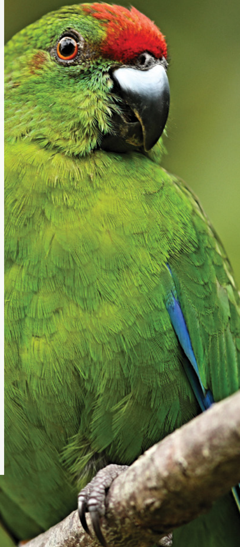
Tasman Parakeet ( Cyanoramphus cookii ) NORFOLK ISLAND

The team continues to make progress on seeing that adults and chicks are protected. Meanwhile, by March of 2017 there were at least 17 females sitting on eggs or raising chicks, potentially adding to the current population of ~100 birds.