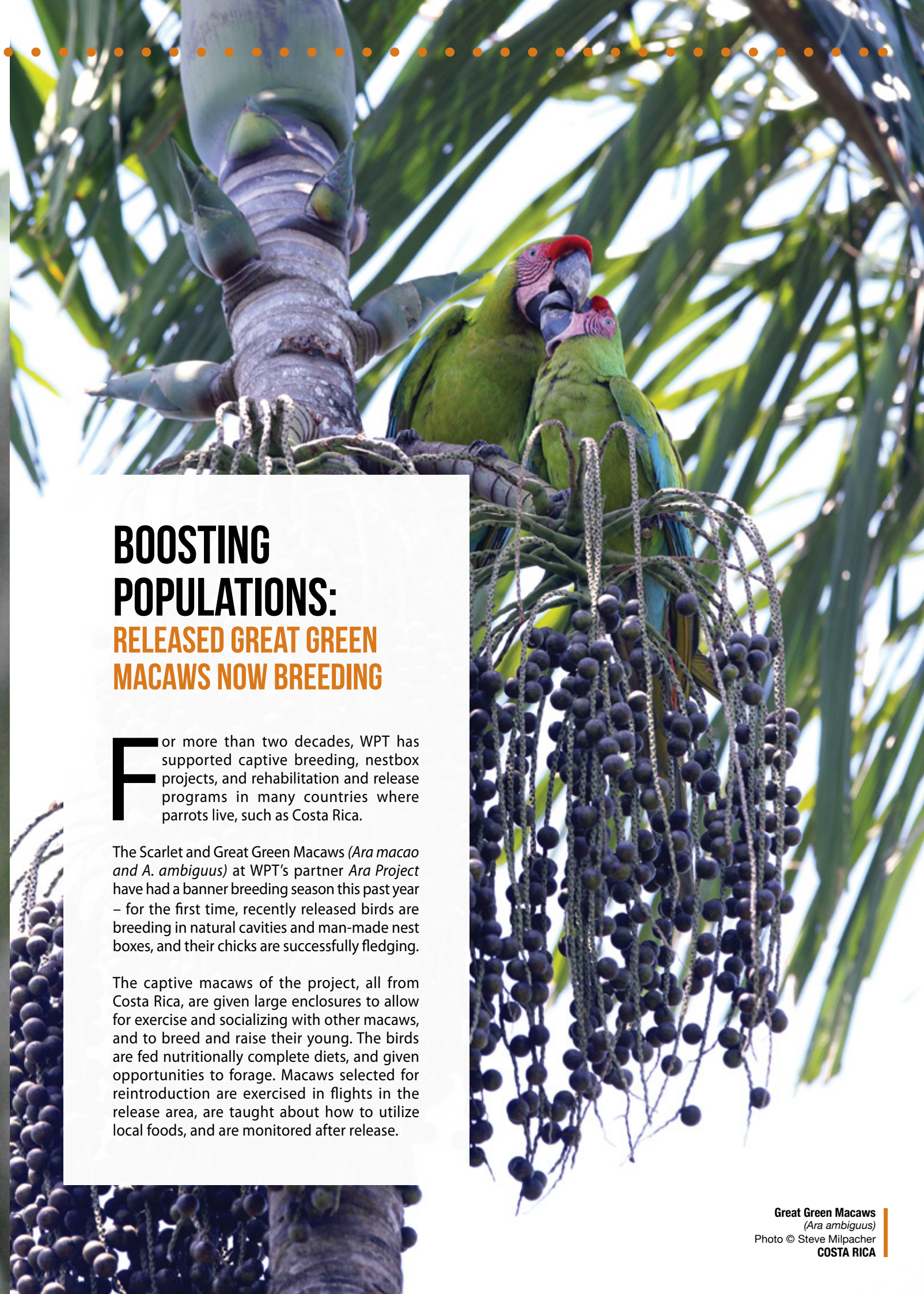
Great Green Macaws ( Ara ambiguus ) COSTA RICA

The captive macaws of the project, all from Costa Rica, are given large enclosures to allow for exercise and socializing with other macaws, and to breed and raise their young. The birds are fed nutritionally complete diets, and given opportunities to forage. Macaws selected for reintroduction are exercised in flights in the release area, are taught about how to utilize local foods, and are monitored after release.