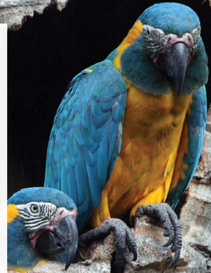
Blue-throated Macaws ( Ara glaucogularis ) BOLIVIA

To the south, the new park connects with Isiboro Secure National Park and to the north, it joins Ibare Mamor Municipal Protected Area, creating an essential corridor for wildlife. The tract's creation will provide protection for over twenty parrot species, 465 bird species and over 50 endangered species. Critically, the area is very important for the Blue-throated Macaw ( Ara glaucogularis ), with 35% of the entire known wild population and 50% of known breeding pairs living there. Additionally, everyone living in the area will have equal access to the benefits of sustainable development and the conservation of natural and cultural resources, and will have a voice in decision-making processes for future conservation actions.