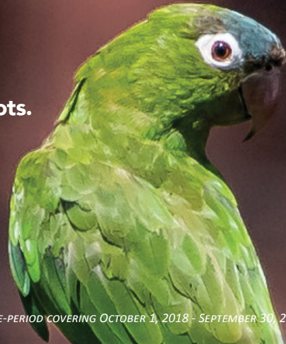
FOR THE TIME-PERIOD COVERING OCTOBER 1, 2018 - SEPTEMBER 30, 2019

We couldn't be more grateful. Your gifts enable us to make encouraging progress on behalf of the world's parrots.