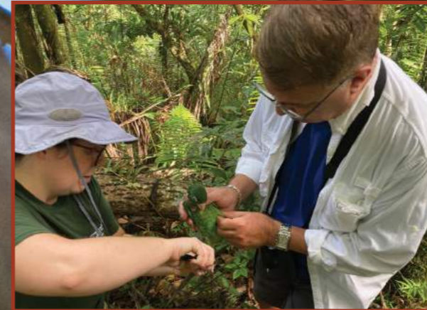
Banding the last chick of the season.