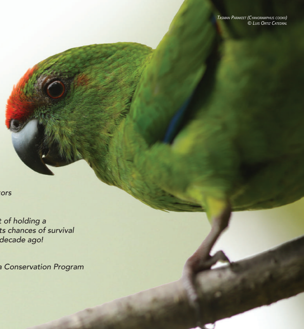
TASMAN PARAKEET (CYANORAMPHUS COOKII)