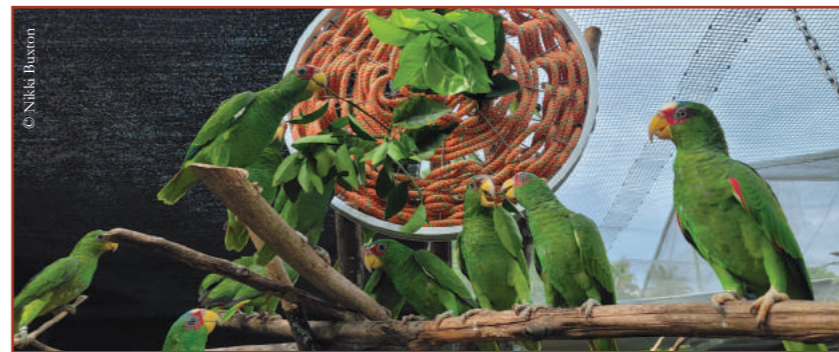
Far left, top: Natural environments provide enrichment for Grey Parrots at WPT's Kiwa Centre. Far left, bottom: Feeding stations are always full of activity in the macaw aviaries at the Kiwa Centre. Current page: Amazons in a pre-release aviary enjoy a foraging wheel at Belize Bird Rescue.

Finally, in early 2022 WPT mobilised hundreds of supporters to provide emergency funding for food, medication and transport to safety for Ukrainians and their companion birds in the war-scarred country.