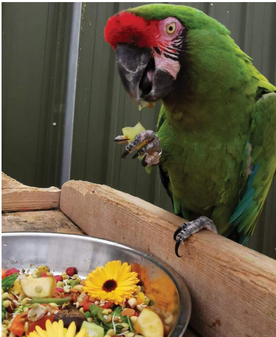
The macaws of the Kiwa Centre, UK enjoy their daily colourful treats.

Finally, there are several bird DVDs on the market showing birds performing natural behaviours for your bird to watch. Watching and hearing another