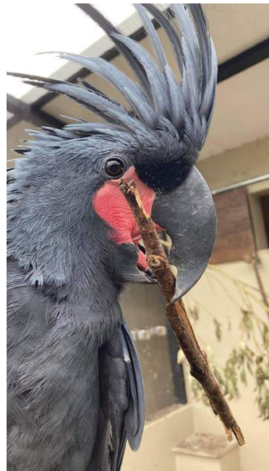
Top: Herbert the Palm Cockatoo shaping his 'drumming stick'. Right: Iris, a female Kea, enjoys a flowery treat.

At the Park we often see our male Palm Cockatoo drumming on a perch with a big stick as part of his breeding behaviour. Companion birds can also drum with suitably-sized foot toys to