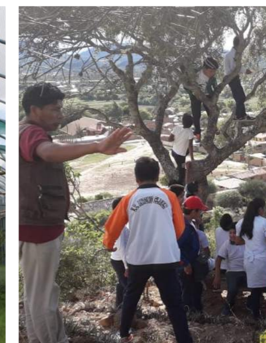
Community education program, Bolivia