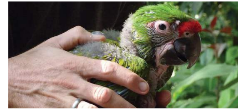
Great Green Macaw chick health check, Costa Rica