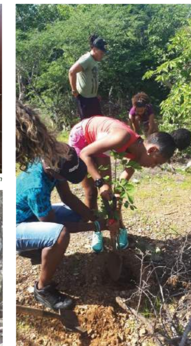
Tree planting program, Bonaire