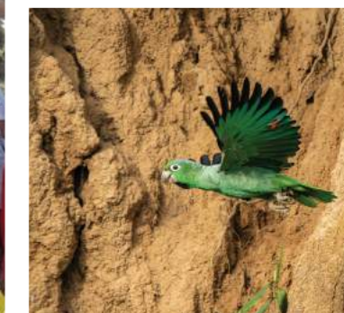
Southern Mealy Amazon, Peru