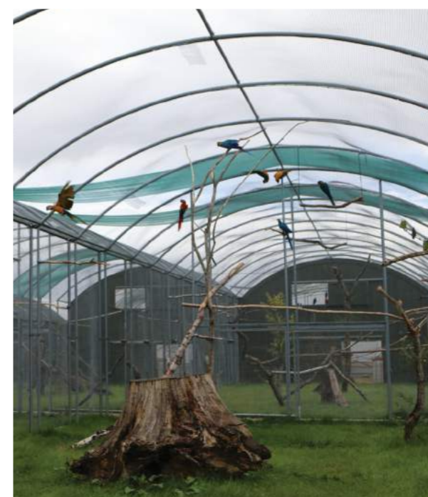
Rescued parrots at the Kiwa Centre, UK