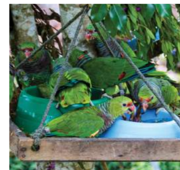
Vinaceous Amazon release, Brazil