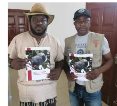
Parrot rescue manual & training, Angola