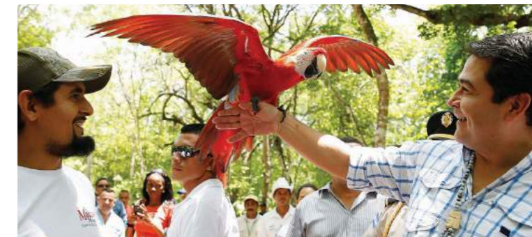
Honduras President with Scarlet Macaw from Macaw Mountain breeding and release program