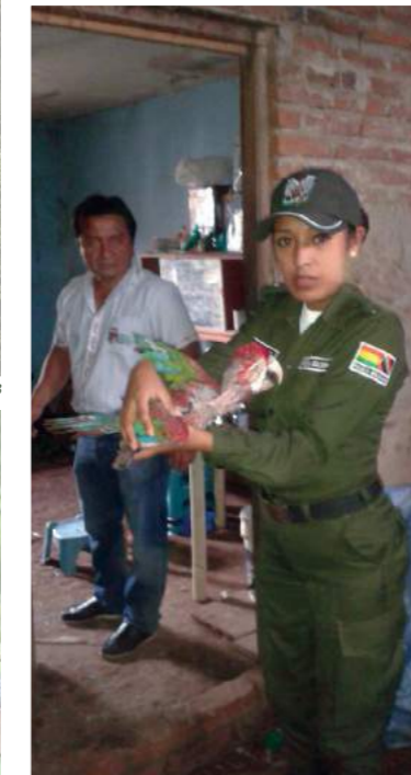
Gov't official with confiscated macaw, Bolivia