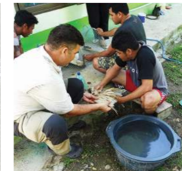
Cleaning damaged feathers, Indonesia