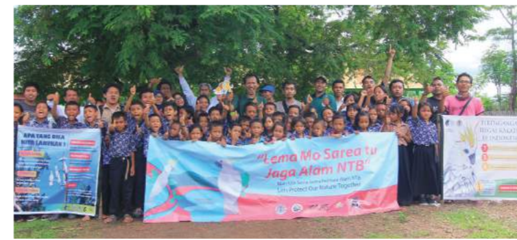
Local communities protecting native cockatoos, Indonesia