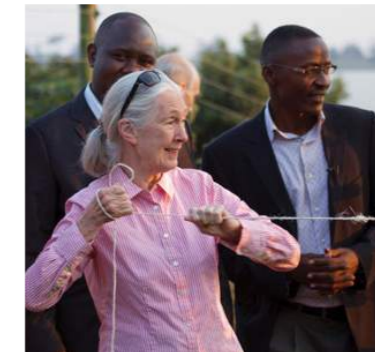
Dr. Jane Goodall assists with Grey Parrot release, Uganda