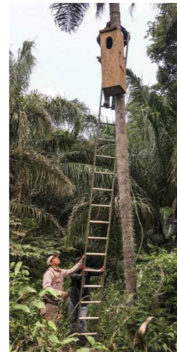
Blue-throated Macaw nestbox installation, Bolivia