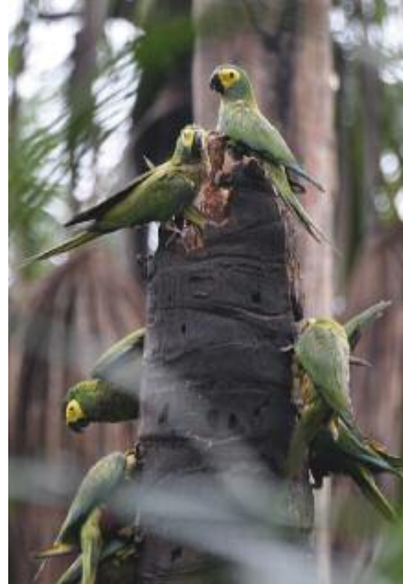
Hundreds of White-bellied Parrots, Red-bellied, Red-shouldered and Blue-and-Gold Macaws gather to eat dead palms near Lake Sandoval. Like the soil of the clay licks, this palm is also high in sodium.

>>> WITH RUMOUR OF BIGGER AND BETTER clay licks, I was itching to get upriver. My chance came at last to go as an assistant guide on a special camping trip to a big colpa named 'Chuncho'. And big it is! Located half an hour upriver by boat from the last park control post and human settlements, it's up to one kilometer (.062 mi) long, and ten meters (32 ft) high. And the number of birds that visited the next sunny morning was beyond my ability to count.