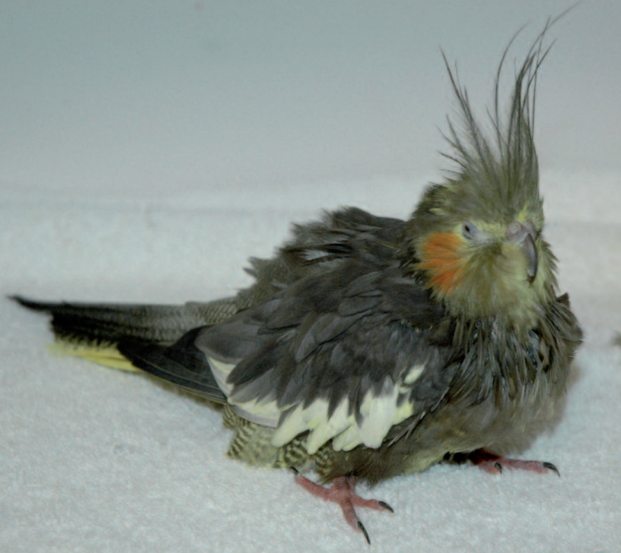
Once birds show symptoms like this Cockatiel, they are often very ill.

All veterinarians are required to complete a four-year course of veterinary training to earn their degree (Doctor of Veterinary Medicine (DVM) or Veterinary Medical Doctor (VMD)). During these four years, students learn about many domestic animal species, and usually have the opportunity to choose a primary focus. Students with a special interest in exotic species, including birds, reptiles, and small mammals, may take special classes and gain hands-on experience in the care of these species. However, most veterinary programs provide only basic knowledge of exotic medicine. Therefore, students with a special interest in exotics must pursue ongoing continuing education after graduation in the form of additional classes, conferences, and mentorship. Alternatively, they can pursue more formal training, in order to become “board-certified” in the specialty of their choice. For an avian medicine specialty in the United States, this credentialing process is overseen by the American Board of Veterinary Practitioners (ABVP), which requires candidates to have completed five years of veterinary practice, and to pass specialty testing, among numerous other credentialing requirements. In the UK this process is overseen by the Royal College of Veterinary Surgeons (RCVS) known as DipZooMed or a European College Diploma, known as DipECAMS.