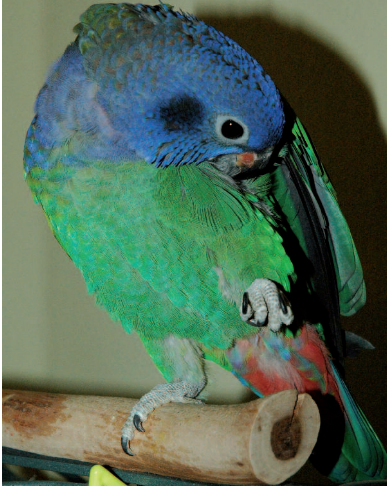
Healthy Blue-headed Parrot is bright-eyed, alert and engaging in normal preening behavior.

Be alert for changes in your bird's droppings, or in your bird's ability to pass droppings, as these can be indicative of disease. Notable abnormalities include passage of black feces (called melena), which can occur with upper gastrointestinal bleeding, blood in the feces, loose feces (diarrhea), passage of undigested food, or malodorous feces. Abnormal urates may appear bright yellow, green or pink, and abnormal urine may be dark green, brown, or contain blood. Changes in urine volume can also be important; if you notice a consistent increase in urine volume, especially if this is accompanied by increased thirst, you should consult your avian veterinarian.